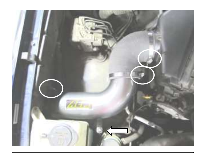
h. Install the M8 washer and nut onto the rubber mount securing the tube. After proper tube orientation has been achieved tighten all three hose clamps.