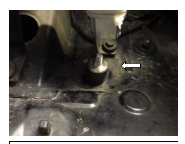
d. Install the supplied rubber mount into the threaded hole next to the reservoir as shown.