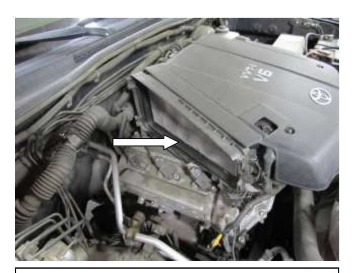
f. The hydrocarbon trap filter will remain in the air box; do not attempt to remove it. The hydrocarbon trap filter is an emission control device and should not be removed to retain legal status in California