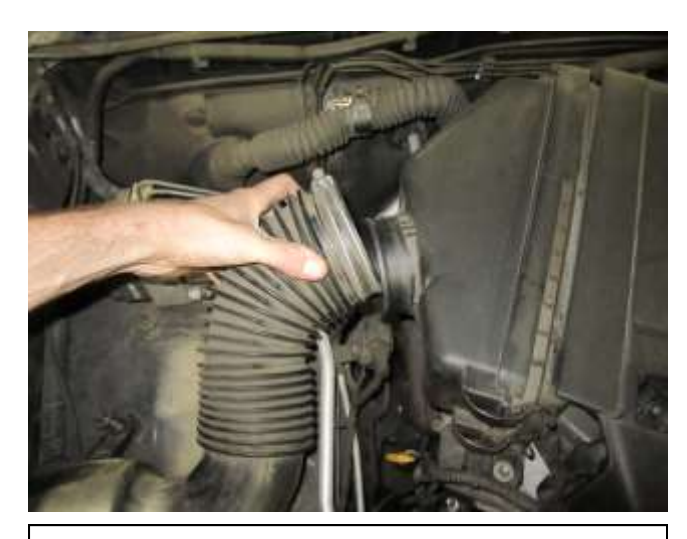
b. Detach the intake tube from the air box.