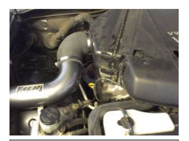
AEM® intake system installed