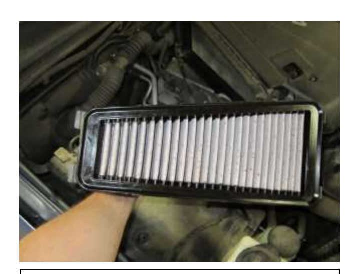
a. Install the AEM filter into the air box lid.

a. When installing the intake system, do not completely tighten the hose clamps or mounting hardware until instructed to do so.