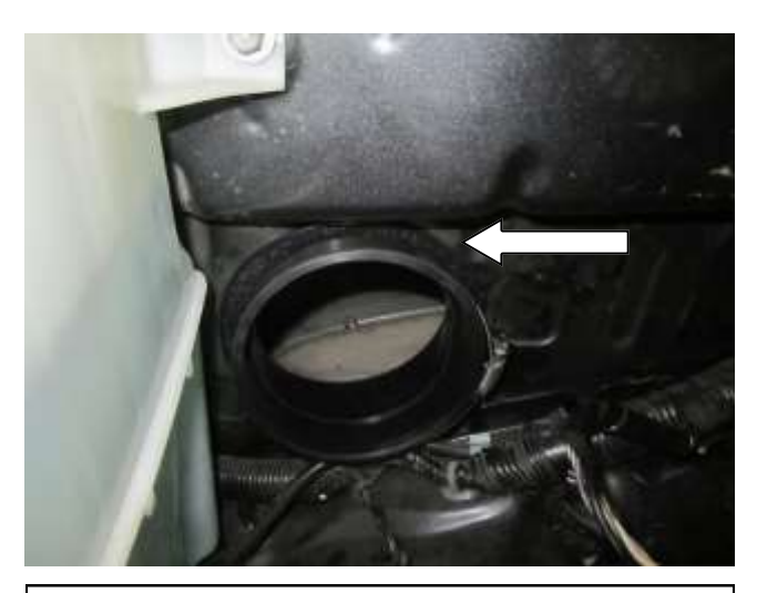
e. Install the edge trim (8-4108) onto the fender. Then squeeze the air accelerator while installing it into the fender with the flat side of the horn pointing down and slide hose clamp on.