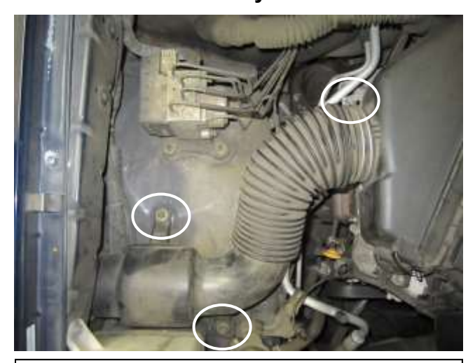
a. Loosen the hose clamp at the air box inlet and remove the two m8 bolts. The bolts will not be reused.