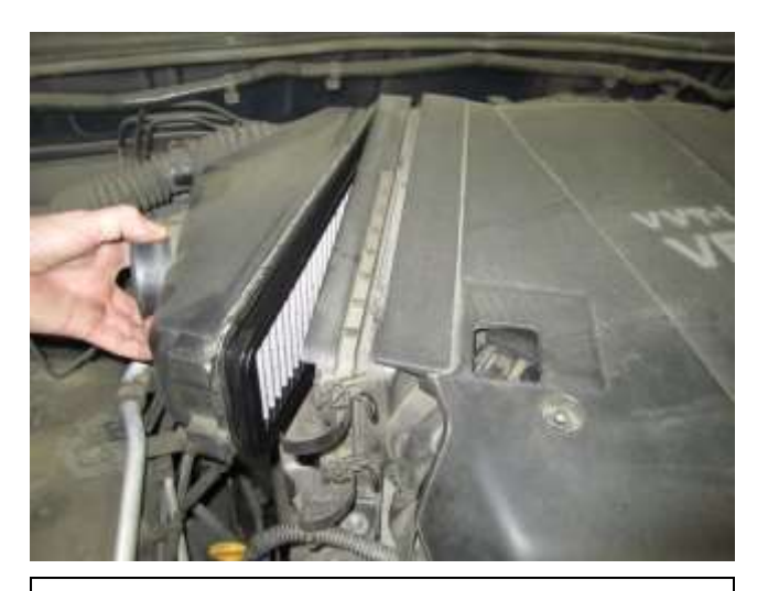
b. Re-install the AEM filter and air box lid to the air box base. Make sure that the back of the lid is correctly hinged.