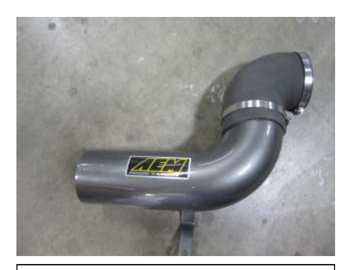
f. Install the 90 degree coupler onto the intake tube with the supplied hose clamps. Do not tighten at this time.