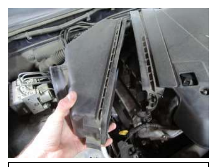
e. Remove the stock air box lid and the filter.