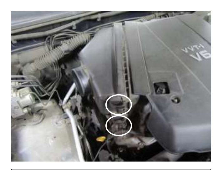
d. Unclip the two stock air box clamps.