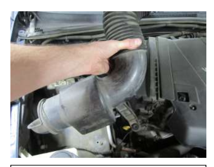
c. Pull the intake tube out of the fender and remove from the vehicle. NOTE: Do not discard your factory intake components.