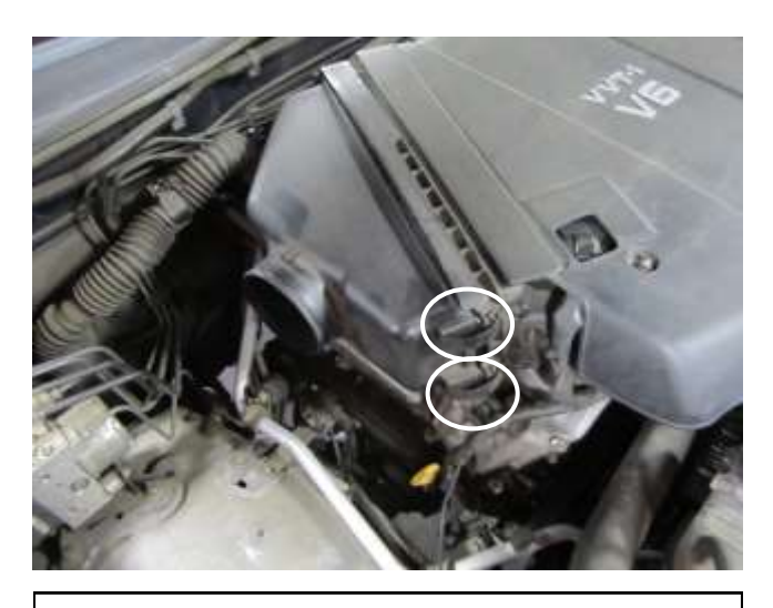
c. Attach the clips that were undone in step 2d.