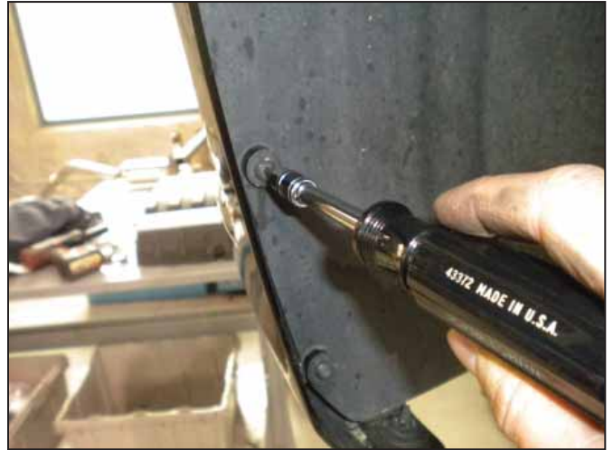
c. Remove the 3 lower Torx T20 retaining screws from the plastic fender well cover.