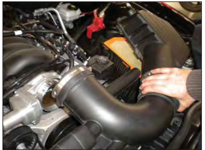
h. Remove the upper intake tube and air box lid from the engine bay. Remember, you will need the factory MAF sensor for your new intake kit.