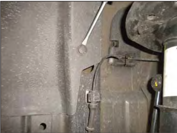
d. Locate and remove the retaining tab at the shock tower with a flat blade screwdriver as shown.