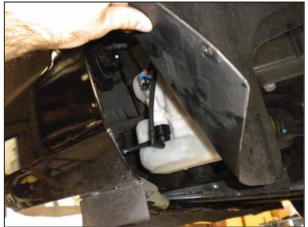
e. Now carefully pull the fender cover away from the fender lip to gain access to the factory washer reservoir.