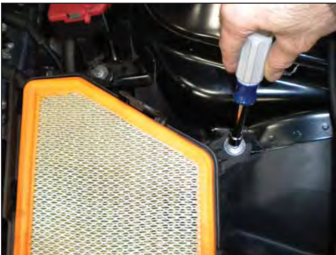
i. To remove the factory lower air housing, start by removing the two retaining nuts at the shock tower brackets and keep them for future use.