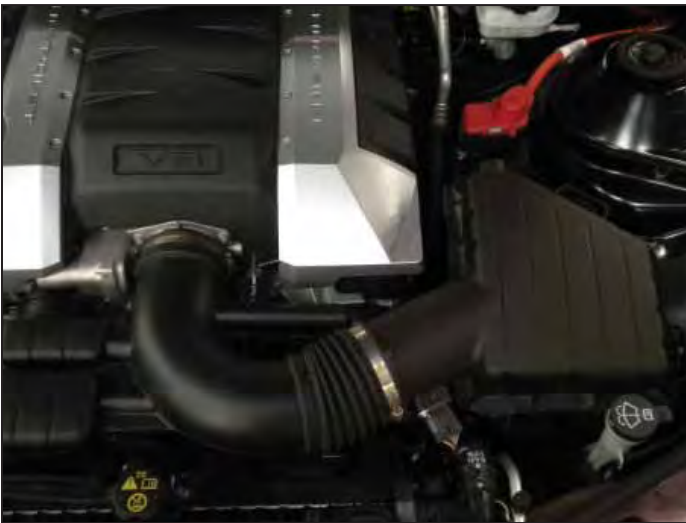
Factory air box system installed

u. In the engine bay, adjust the intake tube so there is about 1" of clearance between the tube and the corner of the washer bottle bracket. Now fully tighten the 2 hose clamps at the throttle body.