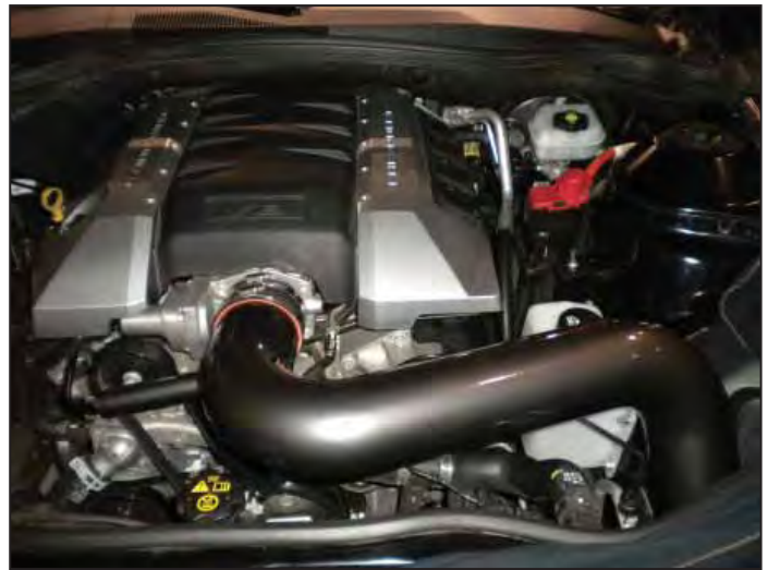
AEM® intake system installed