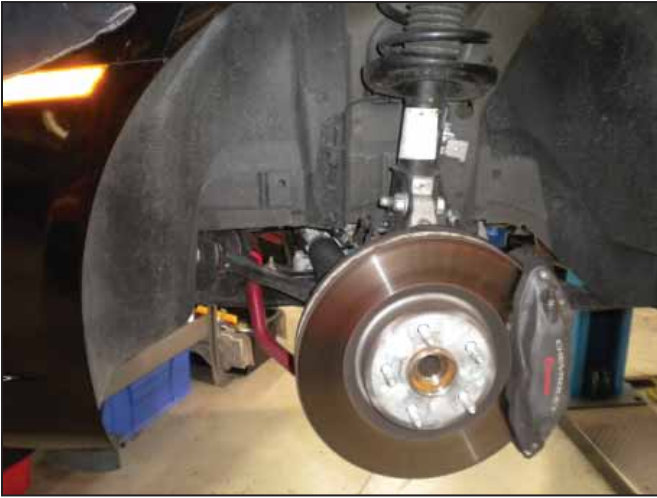
b. Remove the driver's side front wheel.

NEVER WORK UNDER A VEHICLE WITHOUT USING JACK STANDS.