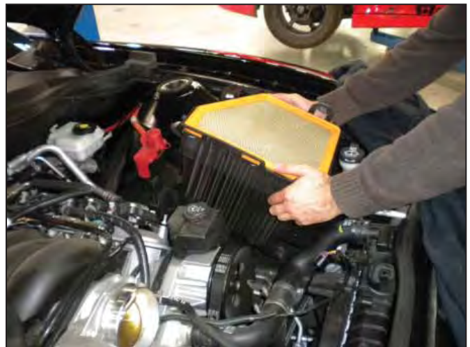
j. Now carefully pull up on the lower box until it pops free from its retaining anchor. Make sure the rubber anchor stays in the frame rail as you will need it to install your new kit. Store the factory air intake system components and filter.