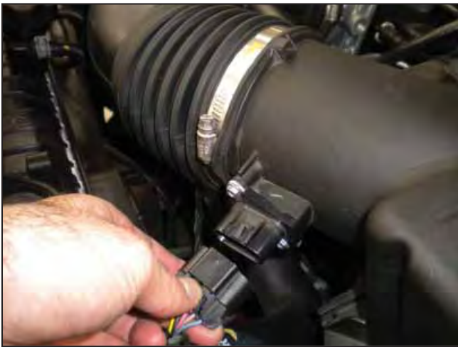
g. Disconnect the MAF sensor wiring harness by depressing the tab and pulling the connector.