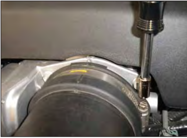
e. Loosen the large hose clamp at the engine throttle body.