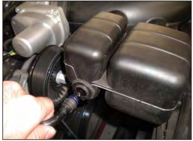
f. Disconnect the plastic breather pipe from the side of the factory intake resonator.