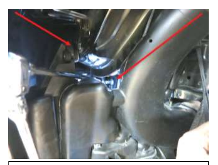
I. First remove the bolt shown above on the left, allowing you to lower the resonator. Using a short 10mm socket and u-joint on the end of at least 14" of extension