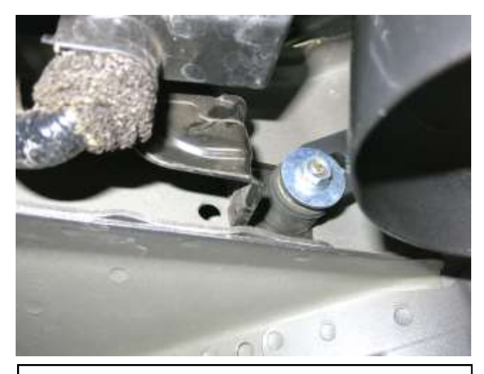
e. Align the tube bracket with the rubber mount that was installed in 3a. Then install the provided washer and nut. Once alignment is correct, tighten nut and hose clamp at throttle body.