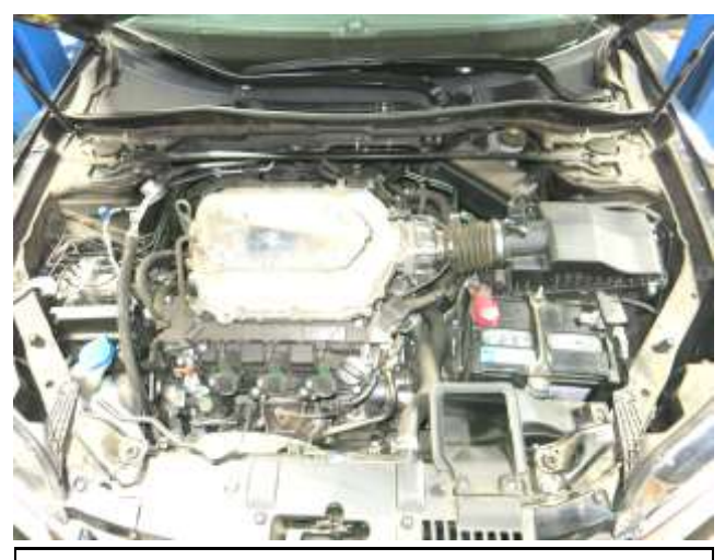
a. Remove the engine cover by lifting straight up.