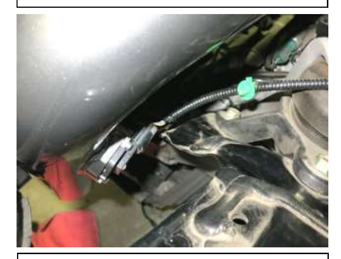
h. Plug the MAF connecter back into the MAF sensor on the AEM intake tube.

j. Reinstall the fender liner and check for clearance at the end of the filter and around the upper edge. If the filter displaces the fender liner, loosen the clamps and bolt, adjust and re-tighten. Reinstall the wheel, taking care to properly torque the wheel to factory specifications. Note: The filter for this application was sized to maximize power output. It may contact the fender liner, but should not displace it. If factory suspension or wheel modification cause contact with the fender liner that pose a risk to the securing of the filter, other filter geometries are available and can be found at http://www.aemintakes.com/search/univcone.aspx.