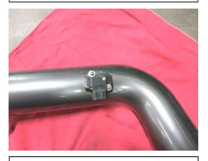
c. Install the MAF sensor and screws into the AEM intake tube from step 2m.