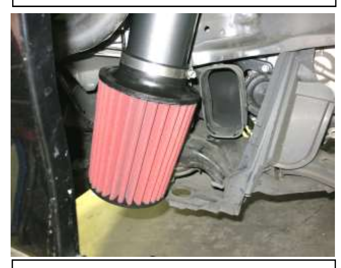
i. Install the AEM filter onto the AEM tube and secure with the provided hose clamp.