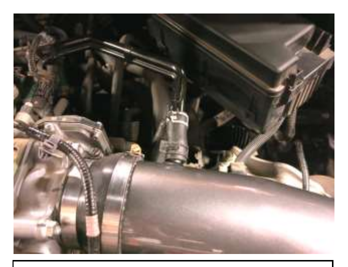
f. Install the provided hose and spring clamp onto the AEM intake tube. Install the vent line into the hose and secure the spring clamp that was removed in step 2c. Note: Trim hose to fit.