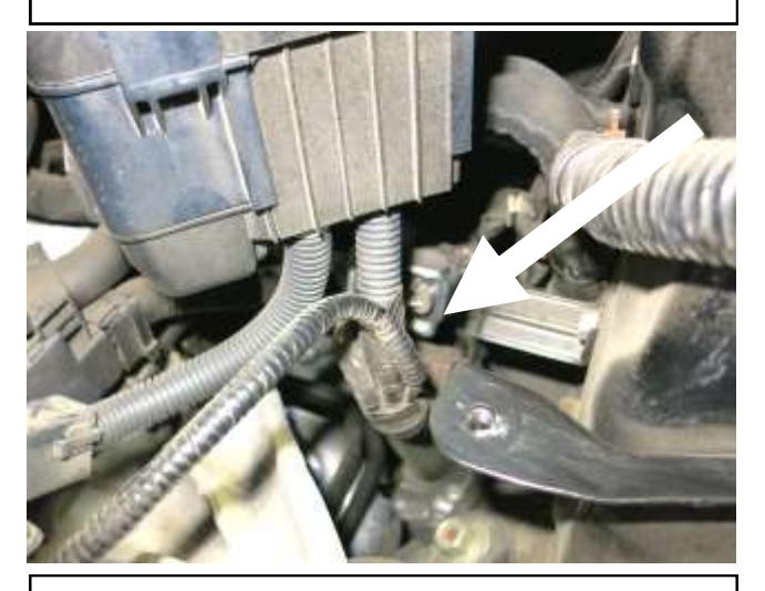
g. Remove the electrical tape that holds the MAF harness to the main wire harness.