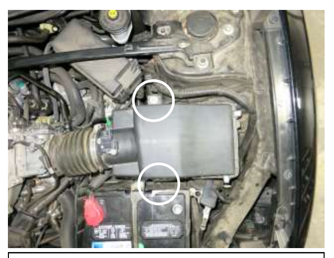
d. Remove the two bolts circled that secure the air box to the vehicle.