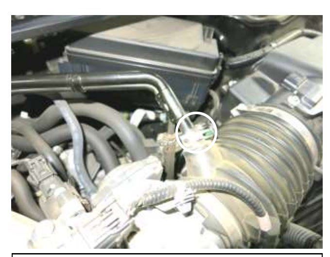
c. Squeeze the spring clamp and remove the vent line from the stock intake tube. This will be reused in step 3f.