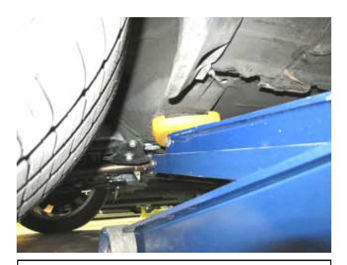
g. Jack vehicle up at a weight bearing location to lift driver-side wheel off the ground, then remove the wheel.