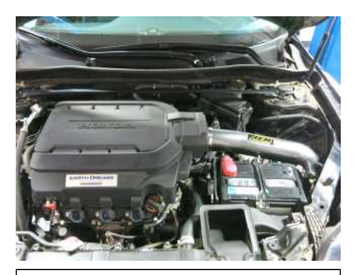
I. AEM INTAKE SYSTEM