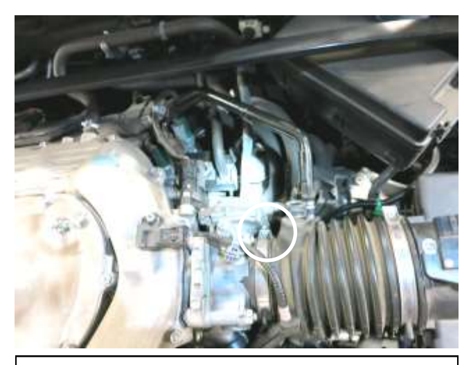
e. Loosen the hose clamp at the throttle body and remove the intake tube from the throttle body.