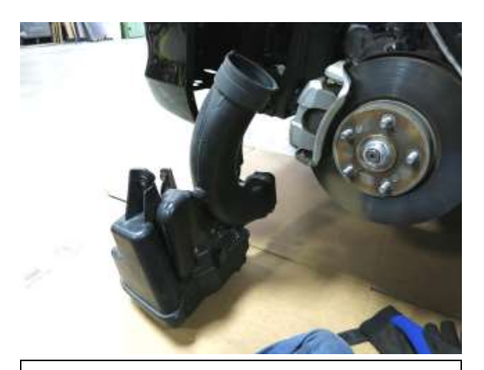
-and remove the bolt on the right. The resonator can then be pulled out as shown above.