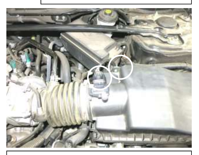
b. Depress the MAF electrical connector and squeeze the green clip to remove the wiring harness from the stock air box.