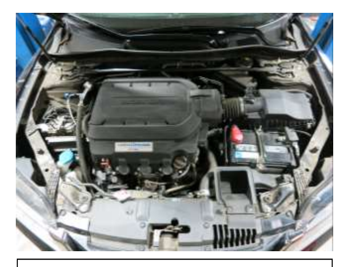
k. STOCK INTAKE SYSTEM