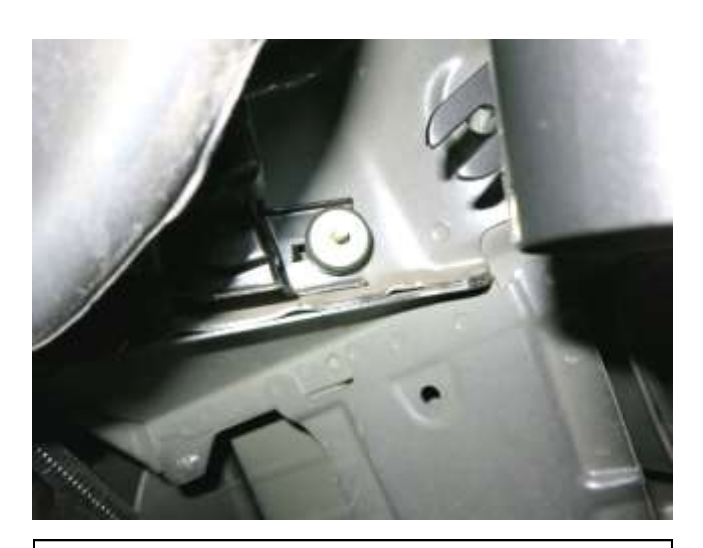
a. Install the provided rubber bushing into the bolt location that was removed in step 2l.

a. When installing the intake system, do not completely tighten the hose clamps or mounting hardware until instructed to do so.