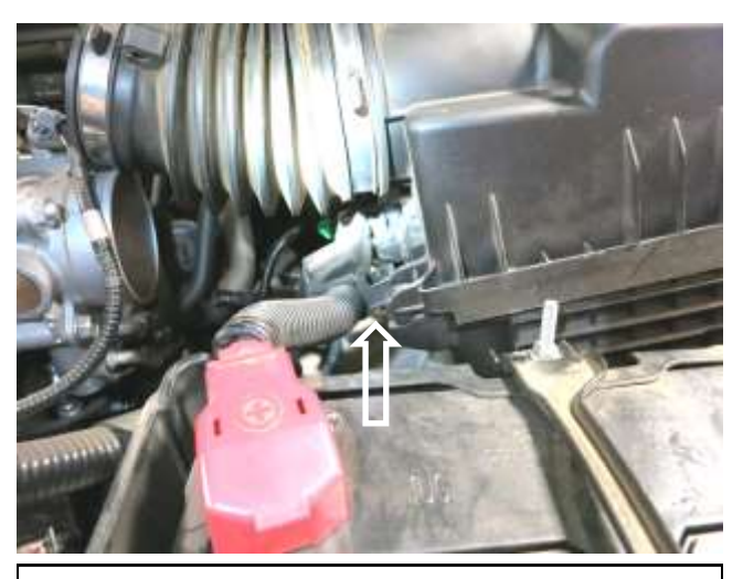
f. Unclip the wiring harness from the stock air box and remove the stock intake system from the vehicle. Note: Do not discard any of your stock equipment.