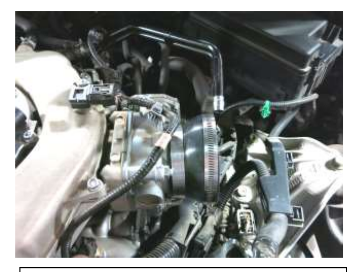
b. Install the included coupler and hose clamps as shown on the throttle body. Tighten the one closest to the throttle body.