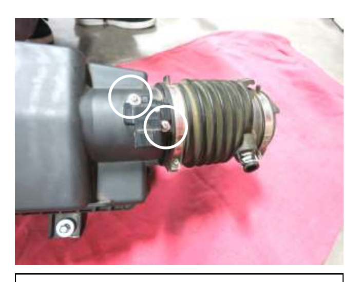
n. Remove the two screws securing the MAF to the stock air box. These will be reused in step 3c.