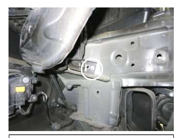
m. Remove the bolt securing the above bracket . This bolt will not be reused.