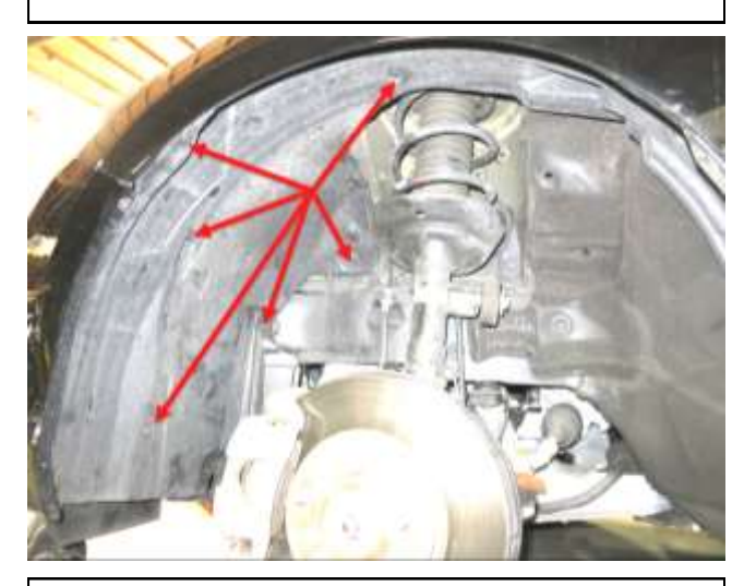
h. Using a flat screw driver, disconnect the nine trim panel clips shown above. Disconnect by inserting screw-