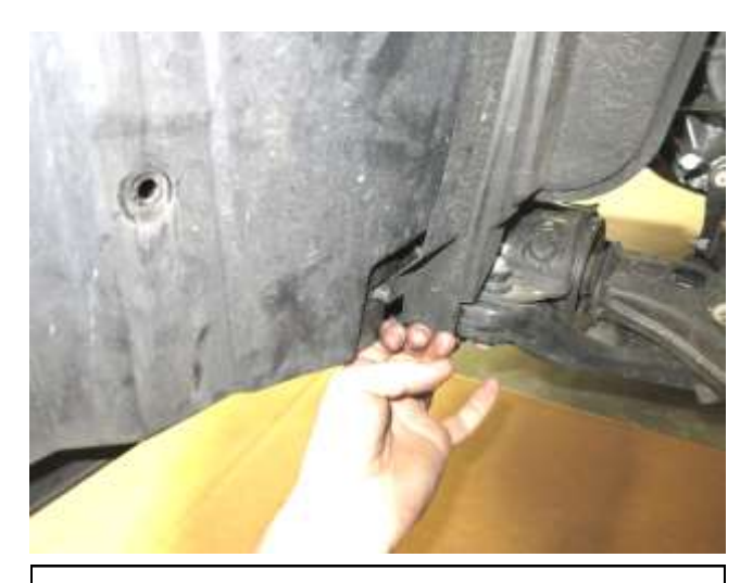
j. Separate the undercarriage panel from the fender liner by rotating them away from each other.