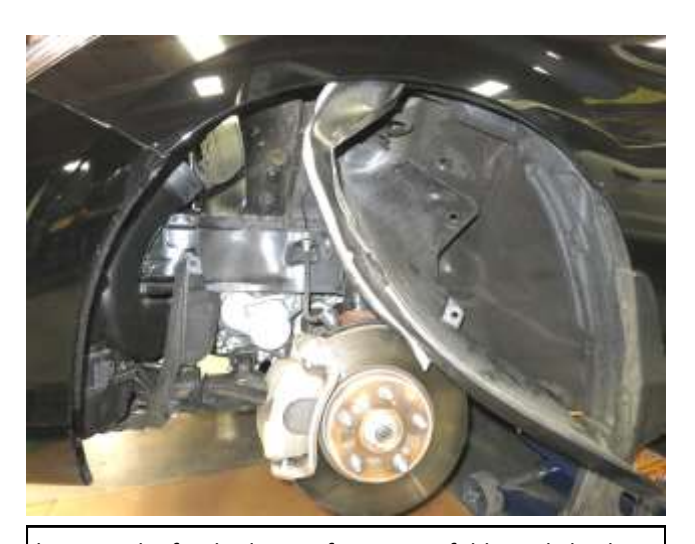
k. Once the fender liner is free, it can fold neatly back behind the brake assembly as shown.