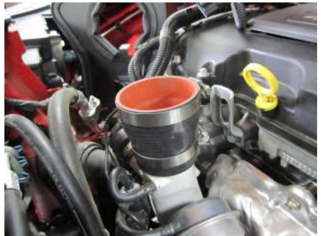
f. Install the coupler and two clamps onto the turbo air inlet. Do not tighten at this time.