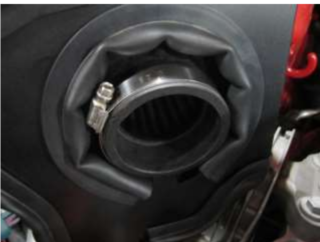
g. Install the filter into the heat shield. Note: The filter flange will rest on top of the heat shield tab and the clamp will go around the flange and the tab.