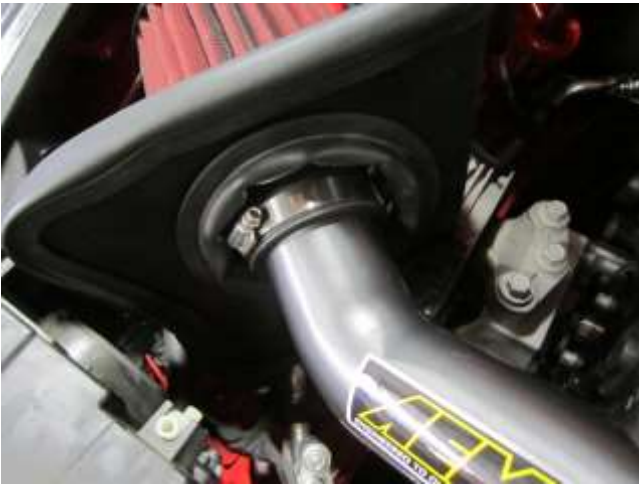
i. Install the AEM intake tube into the filter. Note: Do not fully tighten clamp at this time.