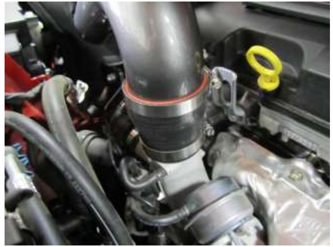
j. Install the other end of the AEM intake tube into the coupler.