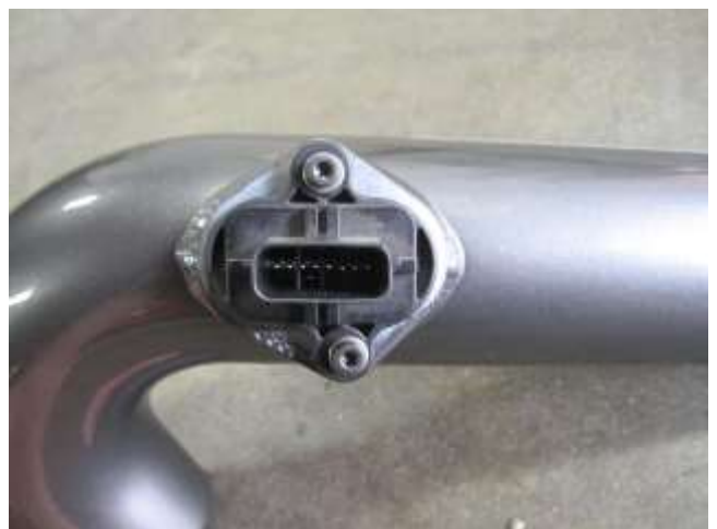
h. Install the mass air sensor that was removed in step 2e. into the AEM intake tube and secure with the supplied hardware.