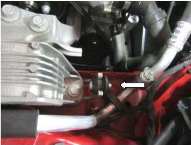
c. Install the supplied M10 bolt into the rubber mount.