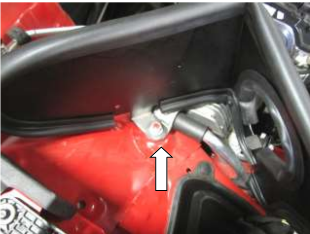
e. Align the other heat shield tab with the engine stud mount. Install and tighten the nut that was previously removed in step 2d.