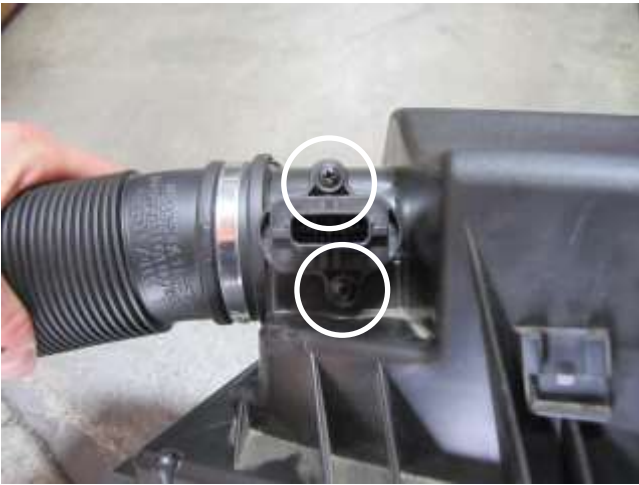
e. Remove the two screws securing the mass air sensor to the air box. Note: The screws will not be reused. The sensor will be reused in step 3h.