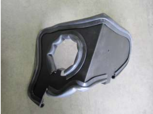
a. Install all 3 pieces of edge trim onto the heat shield as shown..

a. When installing the intake system, do not completely tighten the hose clamps or mounting hardware until instructed to do so.