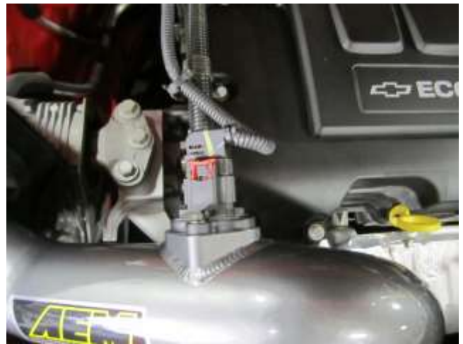
l. Reconnect the harness to the sensor that was removed in step 2a.