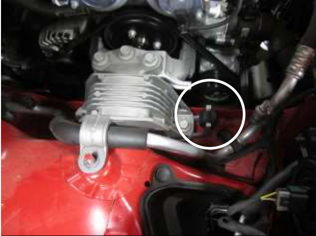
b. Install the rubber grommet that was removed in step 2f. into the mount location as shown.