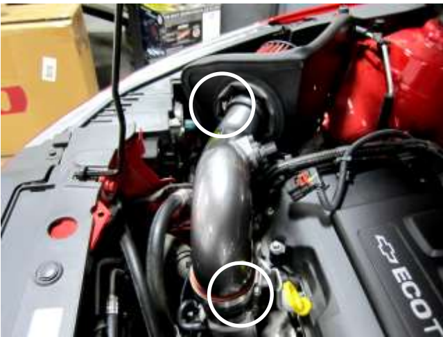
k. Once proper alignment is achieved, tighten all of the hose clamps at the filter and the turbo air inlet.