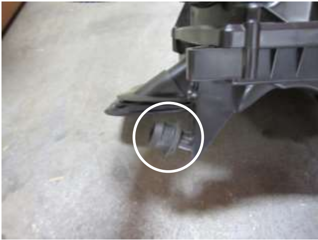
f. Remove the rubber grommet from the stock air box. This will be reused in step 3b.