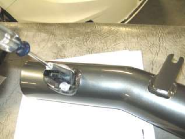
a. Install the MAF sensor and two M2 screws that were removed in 2j and tighten into the AEM intake tube.

a. When installing the intake system, do not completely tighten the hose clamps or mounting hardware until instructed to do so.