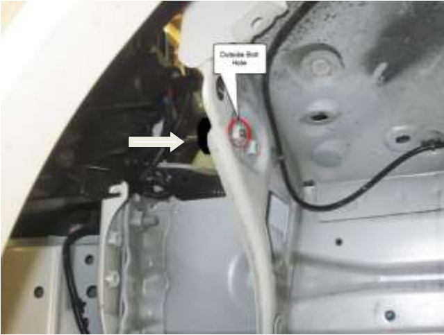
c. Install the second rubber bushings into the "outside" bolt hole in the fender well brace, making sure to capture the harness bracket, and tighten.