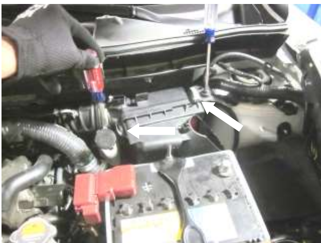
c. Loosen the hose clamp, remove the M6 bolt, and disconnect the two latches securing the air box together.