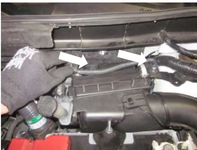
a. Unplug the MAF sensor connector and disconnect the two clips holding the wiring harness to the airbox.