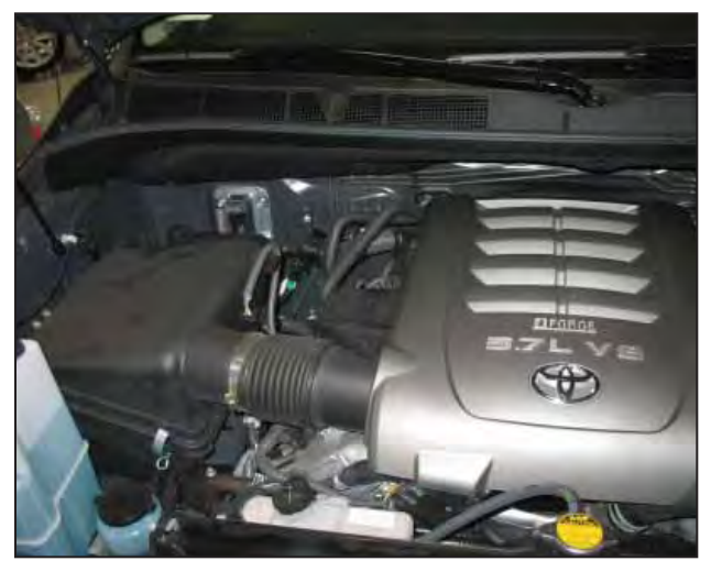
a. Factory airbox system installed.