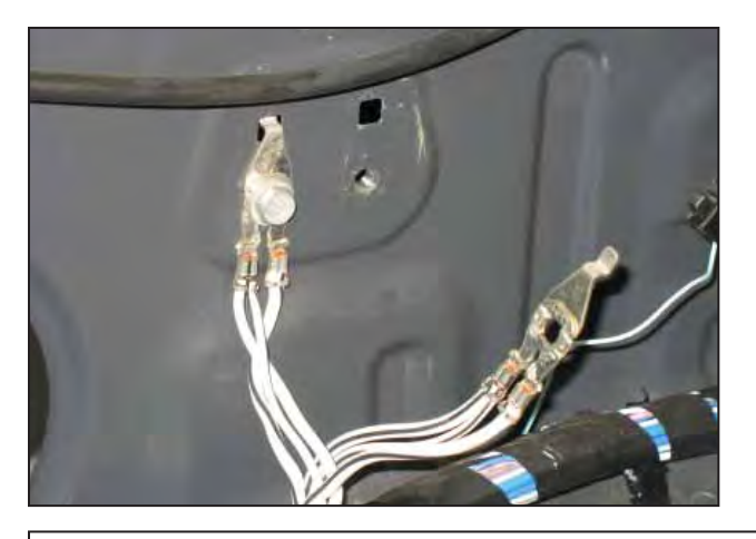
q. Pull the ground strap away from the frame.