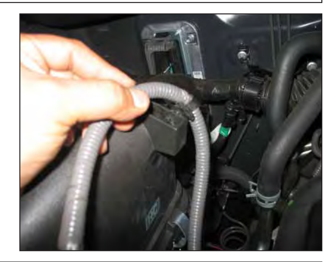
d. Release the zip tie from the airbox lid. Unplug the wire harness plug from the mass air flow sensor.