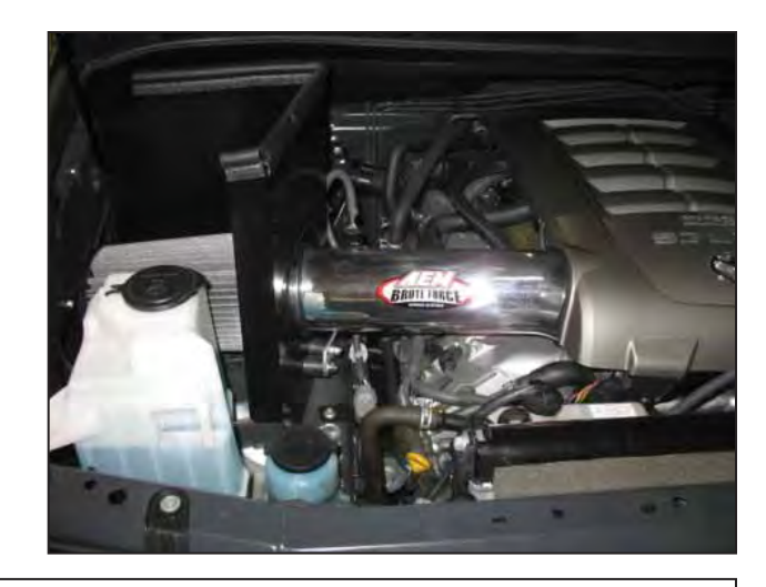
AEM<sup>®</sup> intake system installed