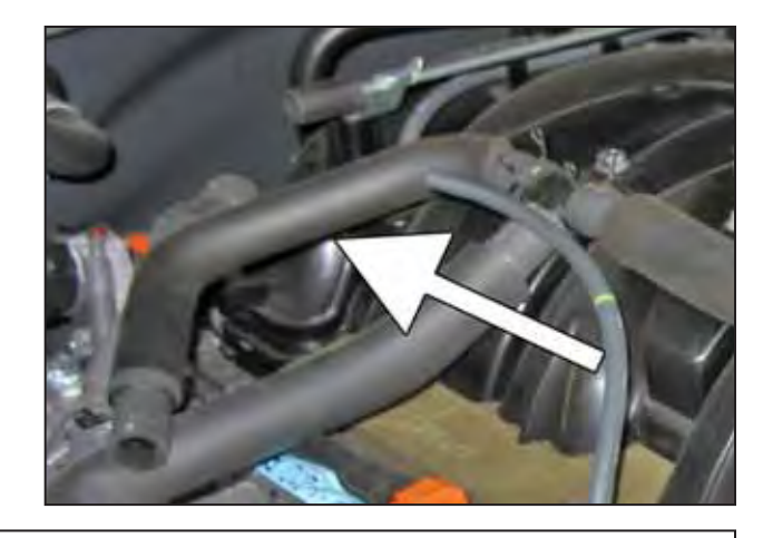
r. Remove the larger stock breather hose from the vehicle.