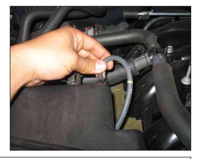
b. Remove the small hose located on the back of the inlet resonator.

c. Pinch the hose clamp, and remove the larger hose from the inlet resonator.