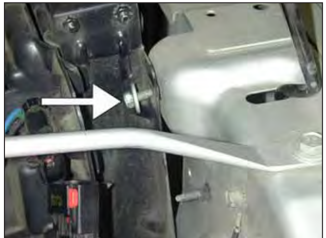
c. Remove the bolt on the passenger side radiator support as shown.