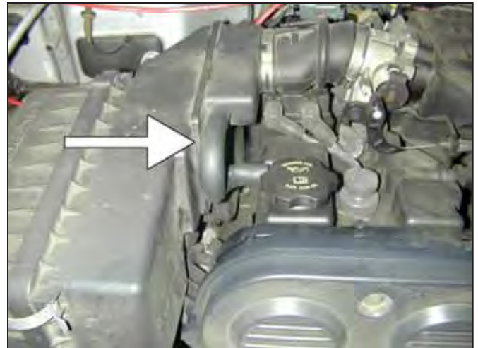
b. Disconnect the breather hose from the air filter housing.