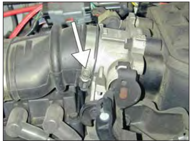
d. Loosen the hose clamp on the throttle body.