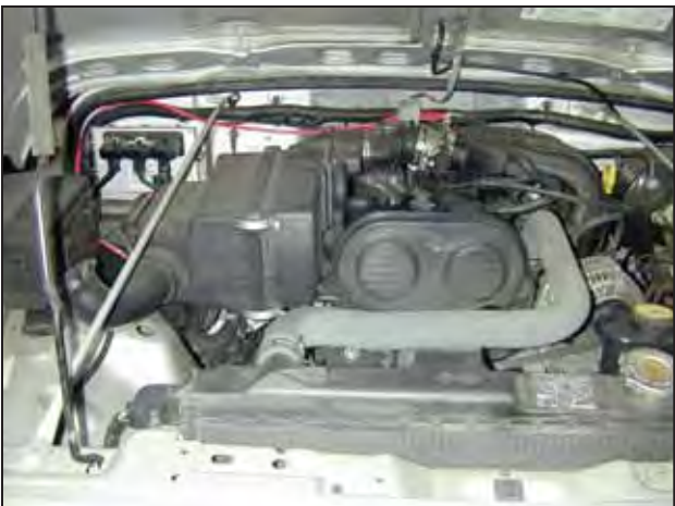
Factory air box system installed

o. Ensure the air filter is not touching any part of the vehicle. Position the AEM® intake system for best fitment. Tighten the hose clamps at the throttle body. Tighten the nut on the mounting bracket. Re-adjust the intake pipe if necessary.