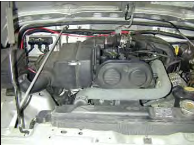
a. Factory air box system installed.