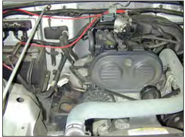
f. Remove the air filter housing from the engine compartment.