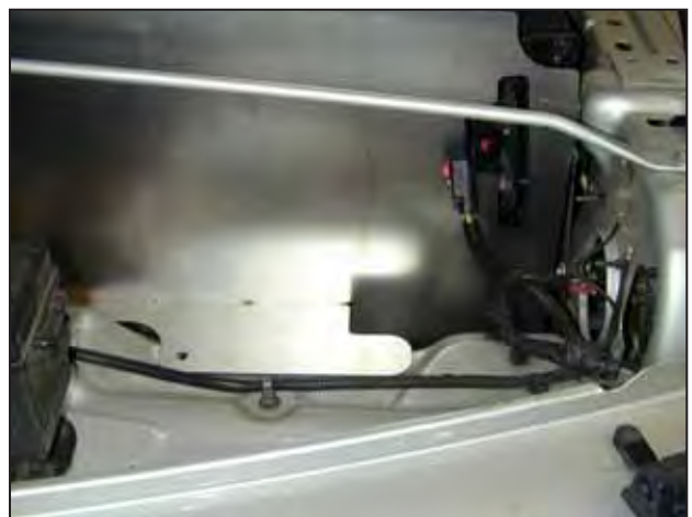
e. Install heat shield into engine compartment and align the front mounting tab with the bolt removed in step 3c.