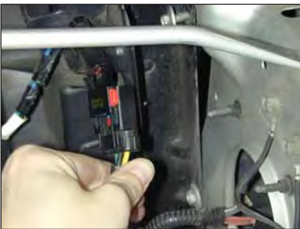
d. Unplug the fan wiring harness from the fan.