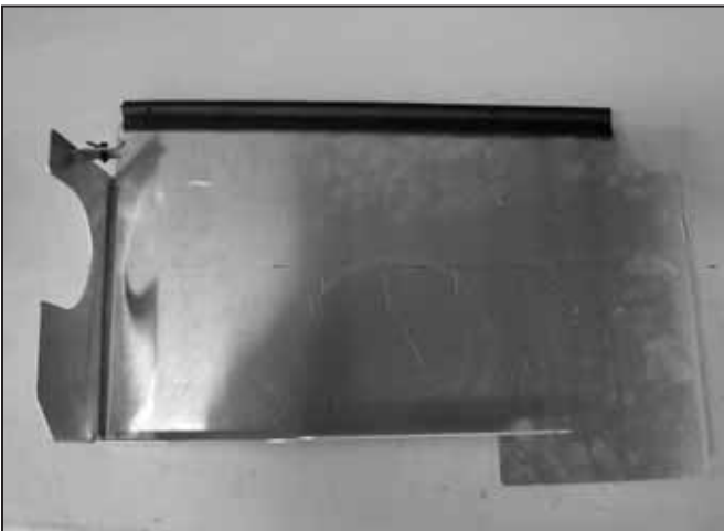
b. Install the supplied rubber edge trim to the heat shield and trim to fit.