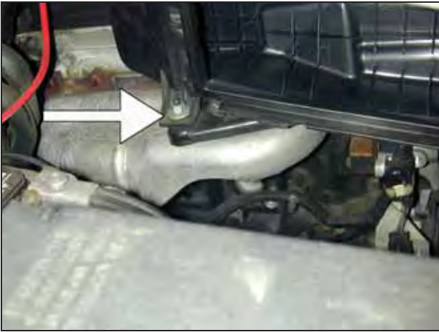
e. Remove the nut securing the air filter housing to the engine.