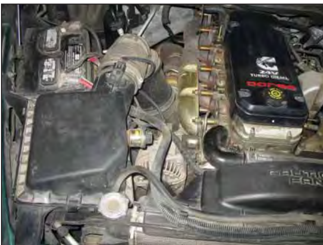
Factory air box system installed

t. Install the filter restriction gauge onto the rubber adapter.