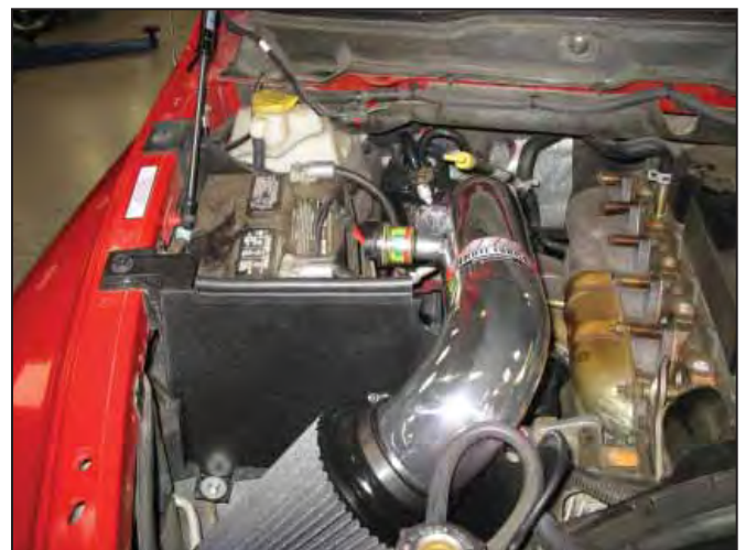
AEM® intake system installed