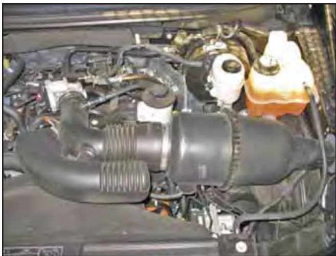
a. Factory air box system installed.