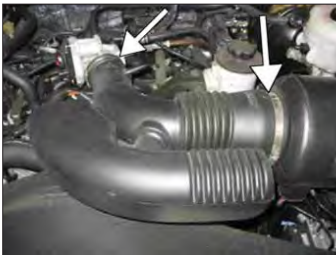
c. Loosen hose clamps at the throttle body and the air filter housing.