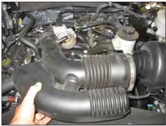
d. Remove upper inlet pipe.