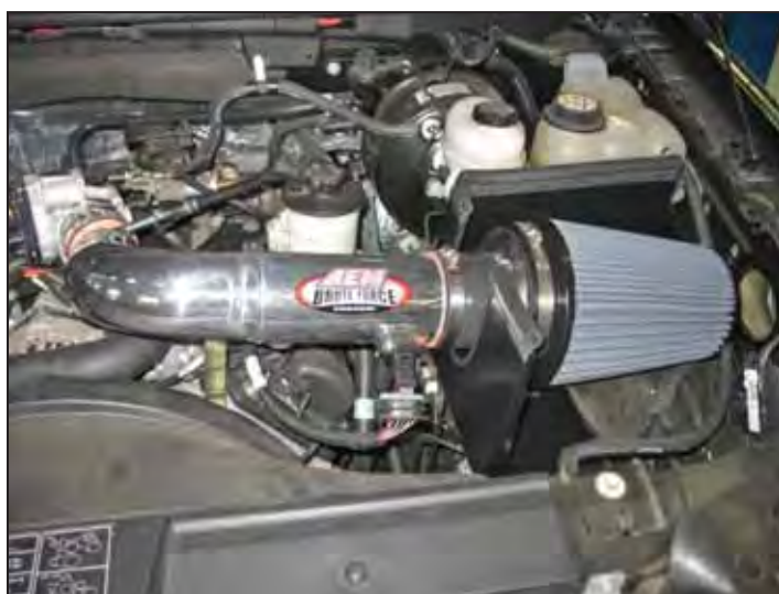
AEM® intake system installed