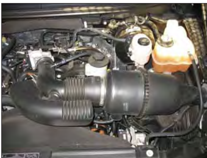
Factory air box system installed

z. Secure mass airflow sensor harness to top bracket with zip tie 1-117.