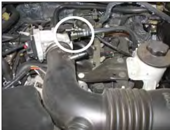
b. Unclip the plastic crankcase breather tube from the stock air inlet tube.