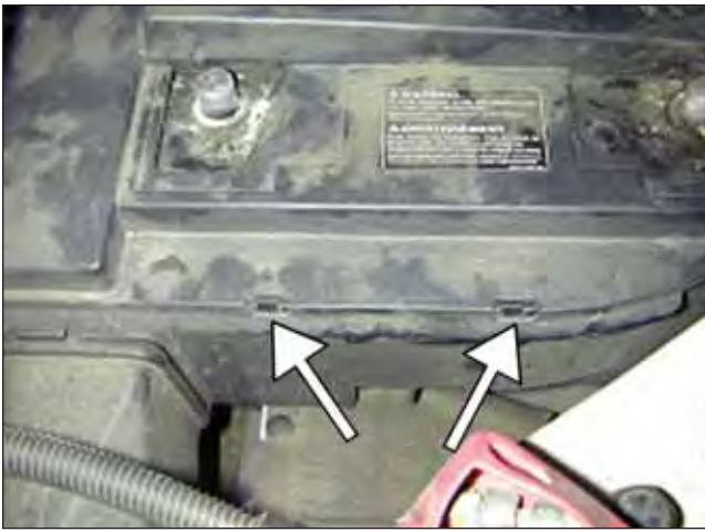
e. Unclip the front side of the battery box cover as shown.