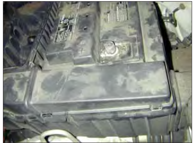
f. Unclip the passenger side of the battery box cover. Remove the battery box cover by gently lifting it straight up and out of the engine bay.