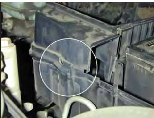
i. Unclip the passenger's side snap of the lower air filter housing. Remove the lower air filter housing.