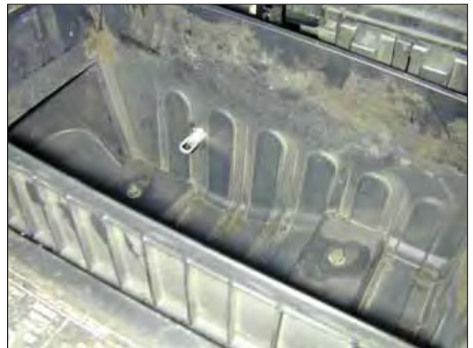
h. Remove the Inlet Air Temperature (IAT) sensor from the air filter housing by rotating it 90 degrees and gently pulling it out.