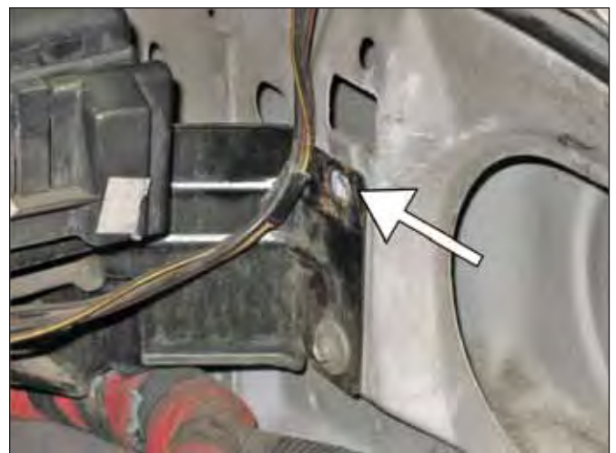
j. With the air filter housing removed, locate the upper bolt securing the fuse block mount to the driver's side fender as shown. Remove the bolt.