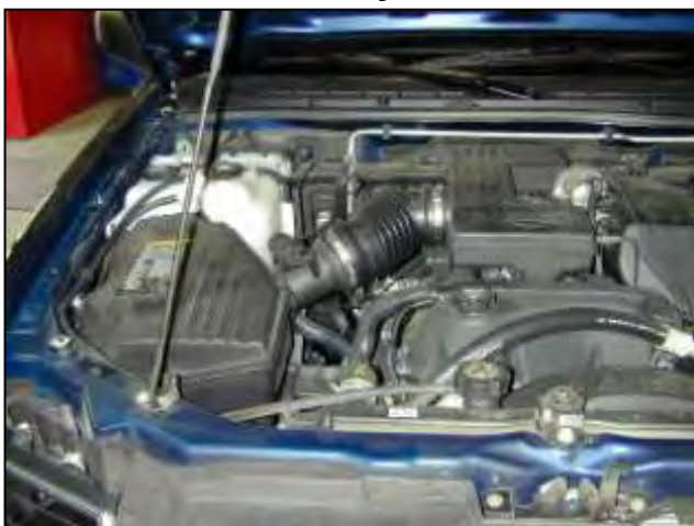
a. Factory air box system installed.