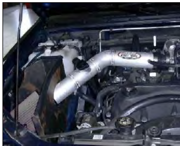
AEM® intake system installed