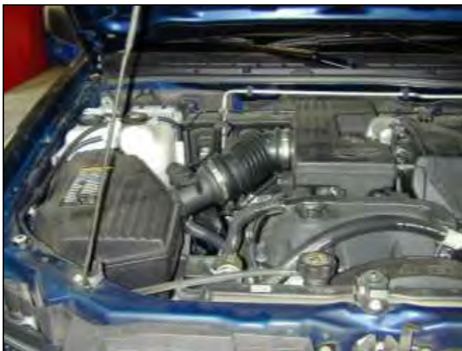
Factory air box system installed

I. Position the AEM® intake for best fitment. Be sure that the pipe or any other component is not in contact with any part of the vehicle. Tighten the hose clamps at the throttle body. Tighten the nut on the mounting bracket. Re-adjust pipe if necessary. Re-connect the MAF wire harness.