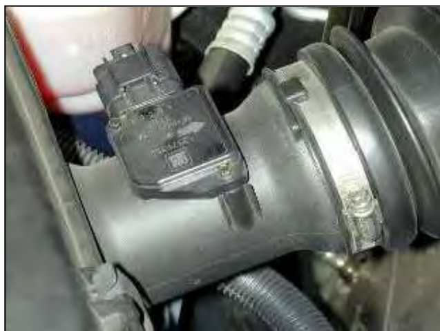
b. Unplug the wire harness from the Mass Air Flow (MAF) sensor. Remove the two screws retaining the MAF sensor and carefully remove the MAF sensor.