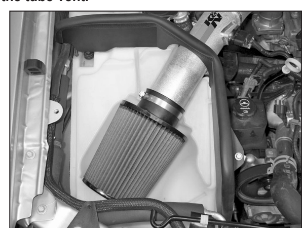
18. Install the K&N® air filter onto the K&N® intake tube and secure with the provided hose clamp. NOTE: Drycharger® air filter wrap; part # RX-4730DK is available to purchase separately. To learn more about Drycharger® filter wraps or look up color availability please visit http://www.knfilters.com®.

NOTE: Vehicles that are not equipped with Air Injection; use the supplied plug (#08246) to cap the tube vent.