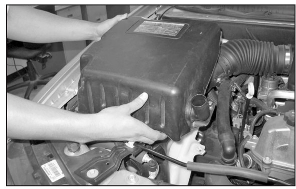
5. Remove the upper air box housing from the vehicle as shown.