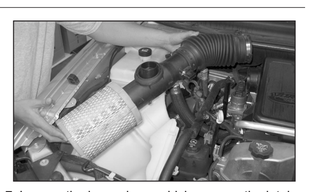
7. Loosen the hose clamp which secures the intake tube to the intake plenum and then remove the complete intake system as shown.

NOTE: K&N Engineering, Inc., recommends that customers do not discard factory air intake.