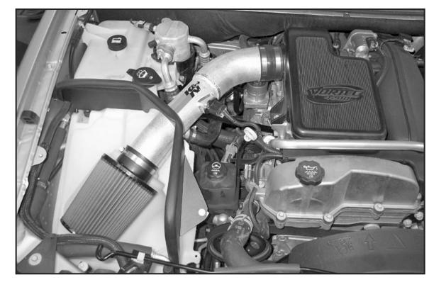
19. Reconnect the vehicle's negative battery cable. Double check to make sure everything is tight and properly positioned before starting the vehicle.