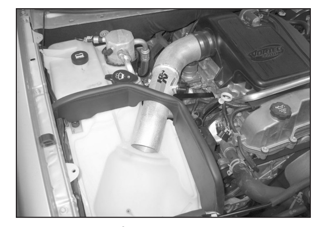
15. Install the K&N® intake tube assembly into the silicone hose at the throttle body and align it with the mounting bracket installed in step #12. Then secure the tube with the provided hose clamp and hardware.