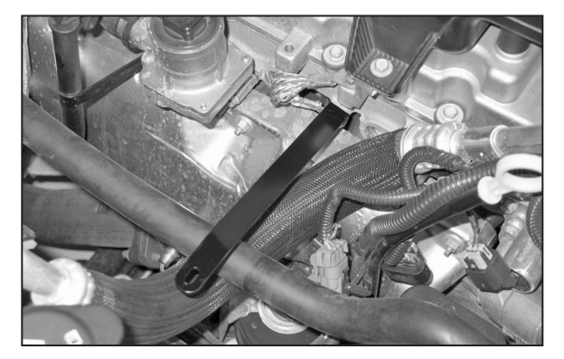
12. Install the tube mounting bracket (26632) onto the engine at the ground cable location and secure with the bolt removed in step #11.