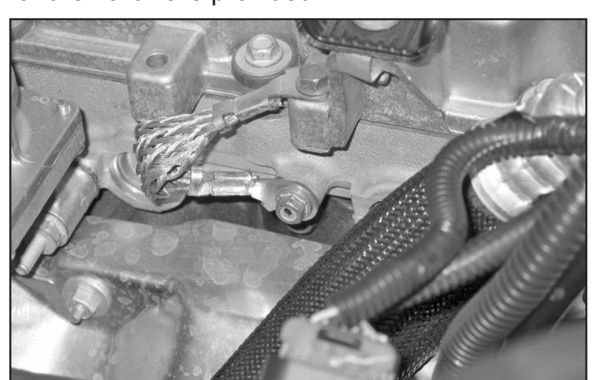
11. Remove the engine ground strap bolt shown. NOTE: This bolt will be reused.