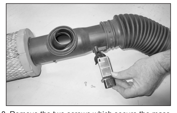
8. Remove the two screws which secure the mass air sensor. Then remove the mass air sensor as shown.

NOTE: K&N Engineering, Inc., recommends that customers do not discard factory air intake.