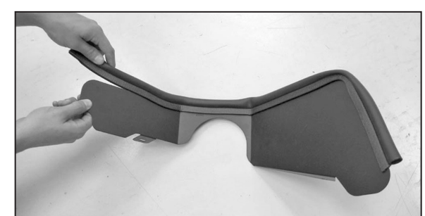
9. Install the provided edge trim onto the heat shield as shown.