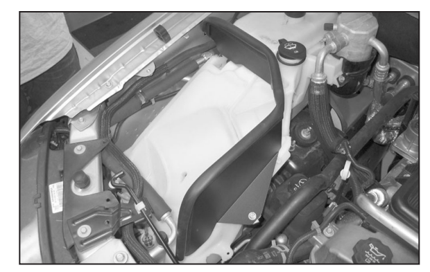
10. Install the heat shield onto the coolant reservoir with the hardware provided.