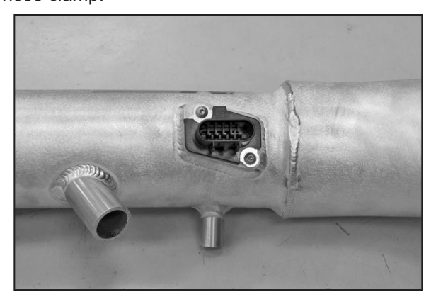
14. Install the mass air sensor into the K&N® intake tube and secure with the provided hardware.