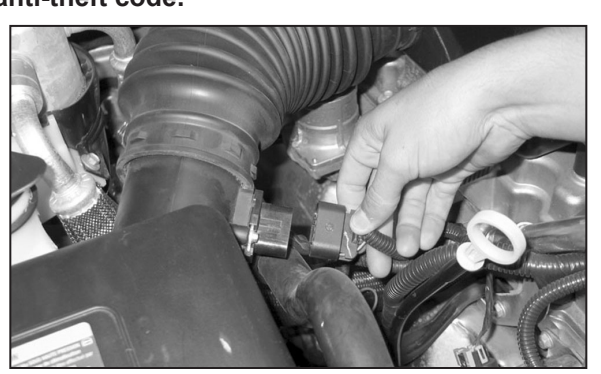
2. Disconnect the mass air sensor electrical connection as shown.

NOTE: Disconnecting the negative battery cable erases pre-programmed electronic memories. Write down all memory settings before disconnecting the negative battery cable. Some radios will require an anti-theft code to be entered after the battery is reconnected. The anti-theft code is typically supplied with your owner's manual. In the event your vehicles' anti-theft code cannot be recovered, contact an authorized dealership to obtain your vehicles anti-theft code.