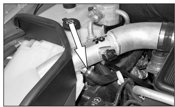
17. Cut the air injection hose at the location marked in step #16. Then install the hose onto the K&N® intake tube and secure with the provided hose

NOTE: Vehicles that are not equipped with Air Injection; use the supplied plug (#08246) to cap the tube vent.