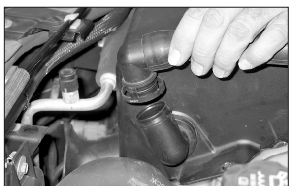
3. Depress the locking tabs and disconnect the air injection hose from the upper air box housing as shown.