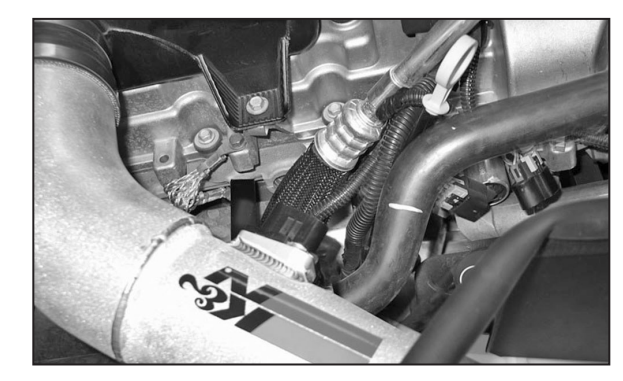
16. Mark the air injection hose at the base of the top 90° bend as shown.