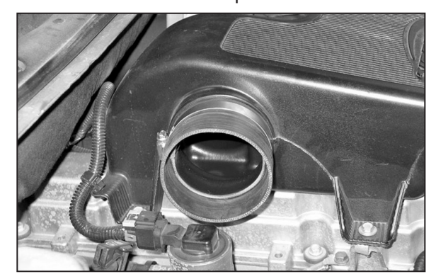
13. Install the provided silicone hose (084091) to the throttle body and secure it with the provided hose clamp.