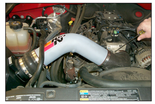
16. Install the K&N<sup>®</sup> intake tube into the angled hose, then, slide the other end into the hump hose. Adjust everything for best fit and clearance and tighten all hose clamps as shown.