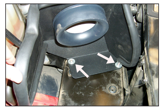
13. Secure the heat shield to the rubber mounted studs using the provided hardware but do not tighten at this time.