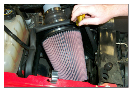
18. Install the K&N<sup>®</sup> air filter onto the mass air adapter and secure it with the provided hose clamp as shown.