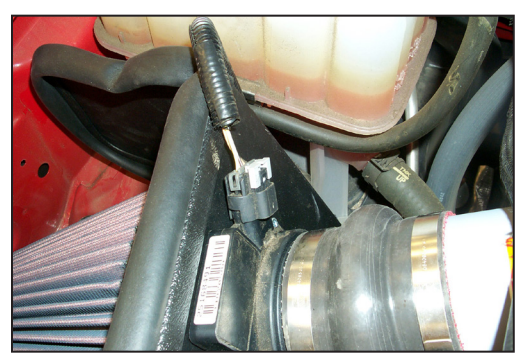
19. Reconnect the mass air sensor electrical connection as shown.