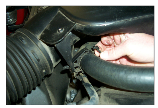
4. Unclip the radiator hose from the stock intake tube as shown.