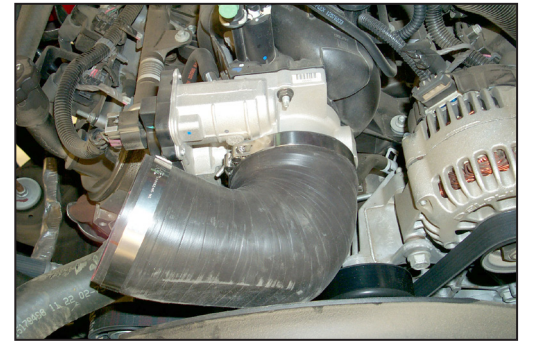
14. Install the silicone angled hose and hose clamps onto the throttle body but do not tighten at this time.