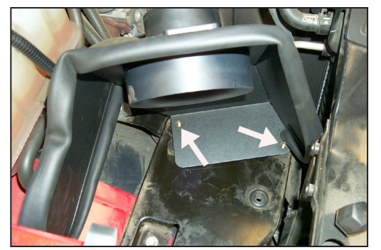
12. Install the heat shield onto the rubber mounted studs as shown.