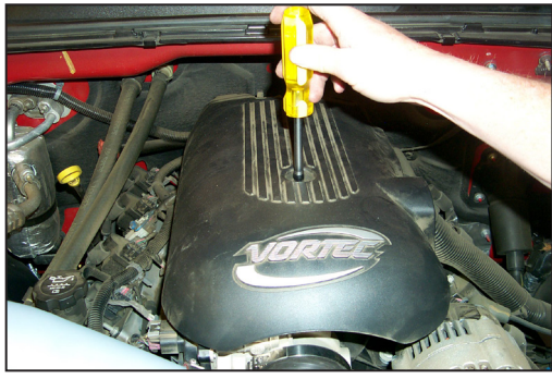
20. Reinstall the engine cover and secure it with the stock hex bolt.