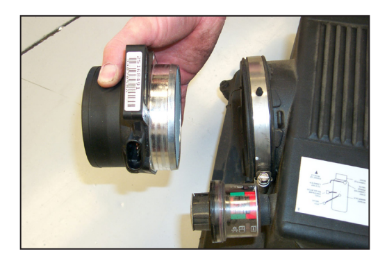
7. Loosen the hose clamp on the air cleaner then remove the mass air sensor as shown.