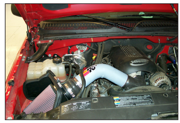
21. Reconnect the negative battery cable and double check to make sure everything is tightened and properly positioned before starting the vehicle.

22. The C.A.R.B. exemption sticker, (attached), must be visible under the hood so that an emissions inspector can see it when the vehicle is required to be tested for emissions. California requires testing every two years, other states may vary.