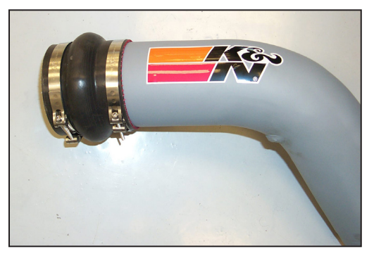
15. Install the silicone step hump hose and hose clamps onto K\&N^{\mbox{\scriptsize \$}} intake tube as shown.