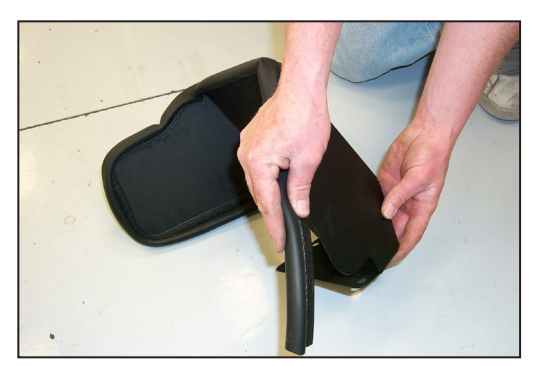
10. Install the edge trim onto the heat shield as shown.