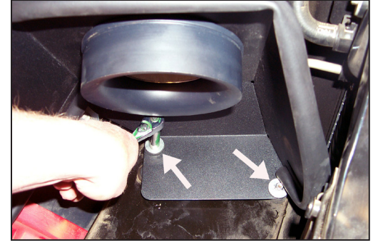
17. Tighten the hardware on the heat shield as shown.