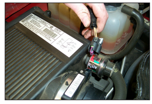
3. Disconnect the mass air sensor electrical connection as shown.

2. Remove the bolt that secures the engine cover, then, remove the engine cover as shown.