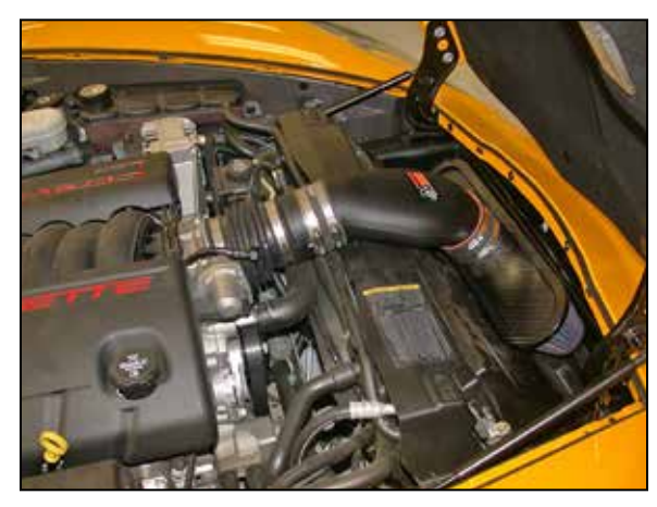
14. Reconnect the vehicle's negative battery cable. Double check to make sure everything is tight and properly positioned before starting the vehicle.

15. It will be necessary for all K&N® high flow intake systems to be checked periodically for realignment, clearance and tightening of all connections. Failure to follow the above instructions or proper maintenance may void warranty.