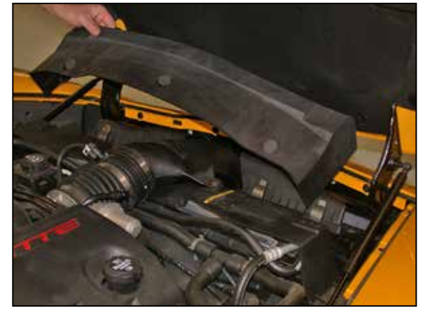
2. Unsnap the ends and then remove the air filter cover as shown.

NOTE: Disconnecting the negative battery cable erases pre-programmed electronic memories. Write down all memory settings before disconnecting the negative battery cable. Some radios will require an anti-theft code to be entered after the battery is reconnected. The anti-theft code is typically supplied with your owner's manual. In the event your vehicles' anti-theft code cannot be recovered, contact an authorized dealership to obtain your vehicles anti-theft code.