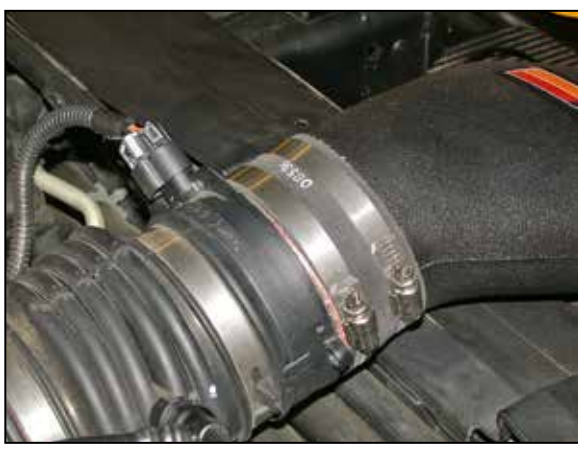
13. Install the intake kit onto the mass air sensor secure with the provided hose clamp.