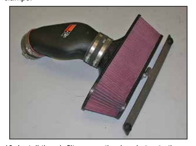
10. Install the air filter mounting bracket onto the air filter as shown and secure with the provided hardware.