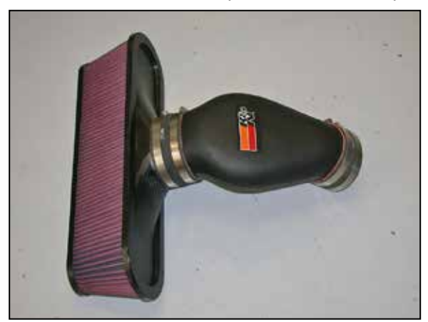
9. Install the silicone hose (08536) onto the K&N® intake tube and secure with the provided hose clamps.