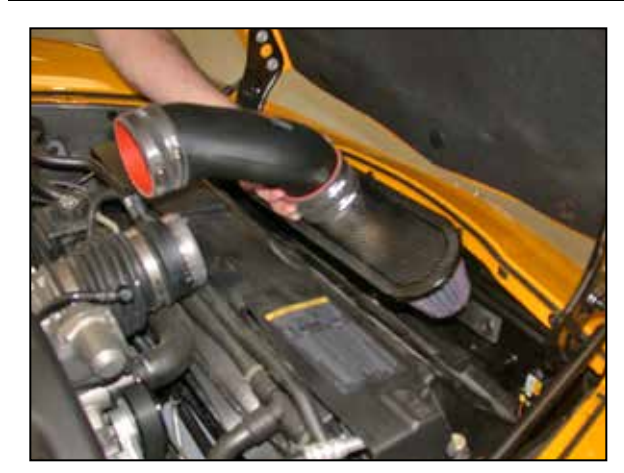
11. Install the intake kit assembly into the vehicle as shown.