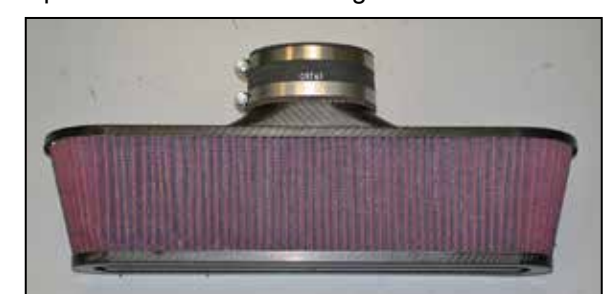
7. Install the silicone hose (08625) onto the air filter as shown and secure with the provided hose clamps