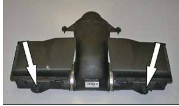
5. Remove the two rubber mounting grommets shown air box as shown.