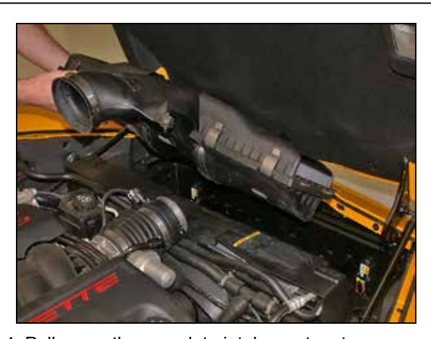
4. Pull up on the complete intake system to disconnect it from the air box mounting pins and then remove it from the vehicle as shown. NOTE: K&N Engineering, Inc., recommends that customers do not discard factory air intake.