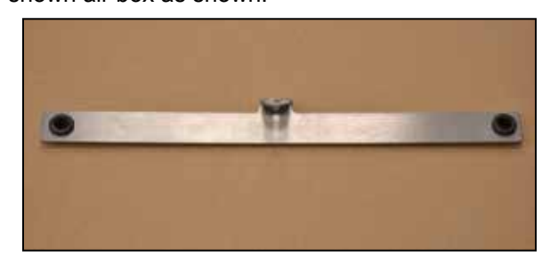
6. Install the two rubber mounting grommets from step #5 into the filter-mounting brackets as shown.