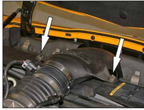
3. Loosen the hose clamp which secures the stock intake tube to the mass air sensor, then pull up to release the center locking pins in the intake tube mounting fasteners shown.