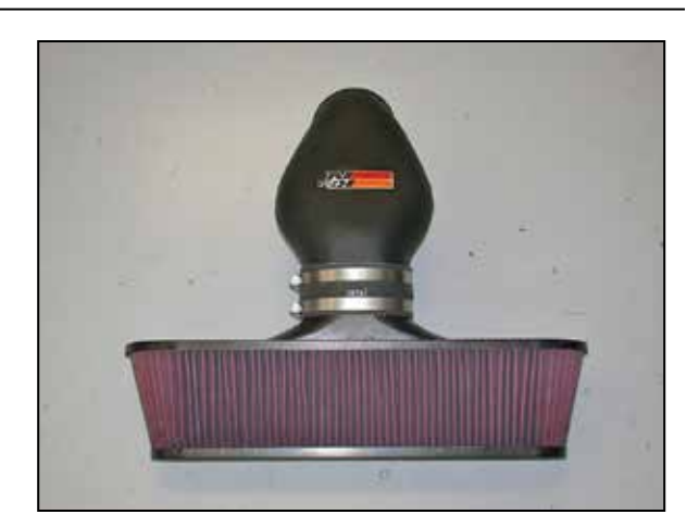
8. Install the K&N® intake tube onto the air filter as shown and secure with the provided hose clamp.