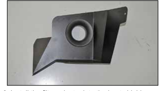
6. Install the filter adapter into the heat shield as shown using the provided hardware.