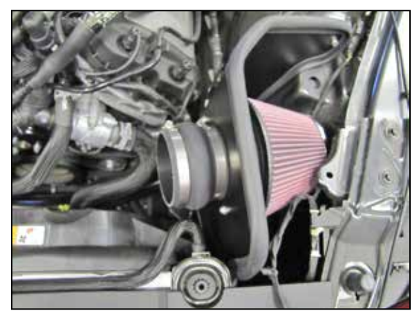
11. Install the provided hump coupler (08699) onto the filter adapter and secure with the provided hose