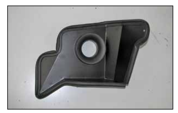
7. Install the provided edge trim onto the heat shield as shown.

NOTE: Some trimming of the edge trim will be necessary.