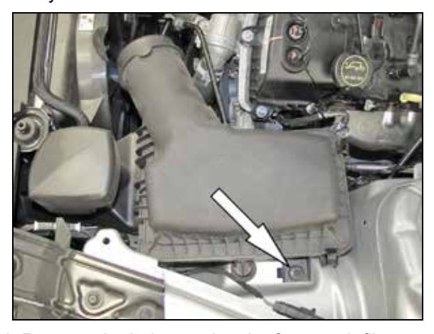
4. Remove the bolt securing the factory air filter housing and then remove the complete air filter housing from the vehicle.

NOTE: K&N Engineering, Inc., recommends that customers do not discard factory air intake.