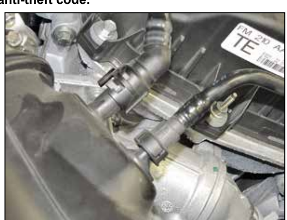
2. Disconnect the crank case vent line and EVAP vent lines from the Intake tube.

NOTE: Disconnecting the negative battery cable erases pre-programmed electronic memories. Write down all memory settings before disconnecting the negative battery cable. Some radios will require an anti-theft code to be entered after the battery is reconnected. The anti-theft code is typically supplied with your owner's manual. In the event your vehicles anti-theft code cannot be recovered, contact an authorized dealership to obtain your vehicles anti-theft code.