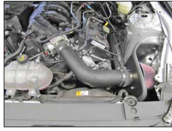
16. Reconnect the vehicle's negative battery cable. Double check to make sure everything is tight and properly positioned before starting the vehicle.

17. It will be necessary for all K&N® high flow intake systems to be checked periodically for realignment, clearance and tightening of all connections. Failure to follow the above instructions or proper maintenance may void warranty.