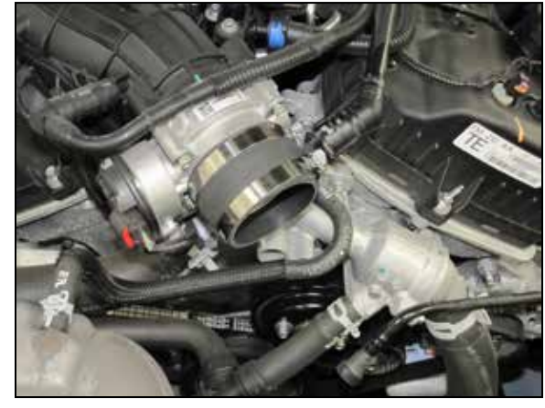
12. Install the provided straight coupler (08711) onto the throttle body and secure with the provided hose clamp.