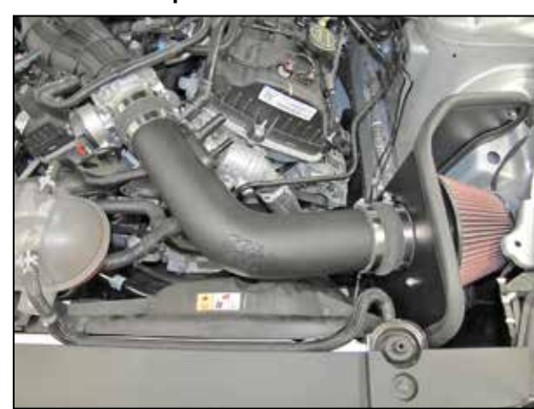
14. Install the intake tube fully into the hump coupler and then into the straight coupler at the throttle body, adjust the tube for best fit and then secure with the provide hose clamps.

NOTE: Plastic NPT fittings are easy to cross thread. Install the vent fitting "hand" tight, then turn it two complete turns with a wrench.