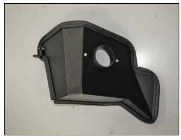
8. Install the provided mounting bracket (064326) and spacer onto the heat shield using the provided hardware.

NOTE: Some trimming of the edge trim will be necessary.