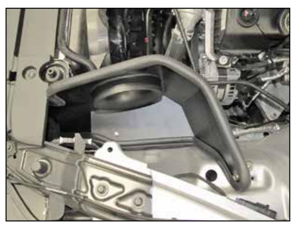
9. Install the heat shield onto the lower mounting bracket and then secure it only to the lower mounting bracket at this time.

NOTE: The spacer should be placed between the heat shield and bracket.