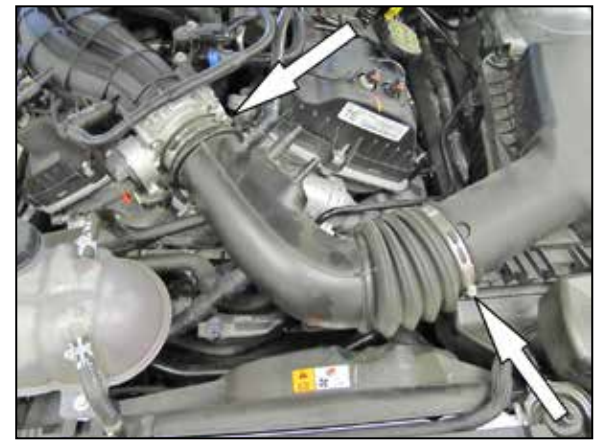
3. Loosen the hose clamps and then remove the factory intake tube.