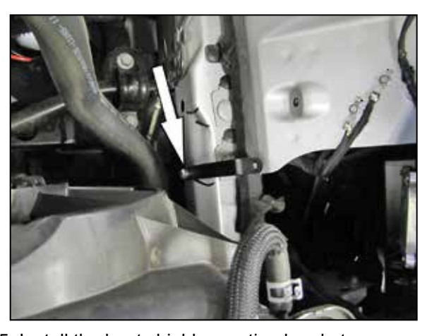
5. Install the heat shield mounting bracket (064325) onto the inner frame rail with the provided hardware as shown.

NOTE: K&N Engineering, Inc., recommends that customers do not discard factory air intake.