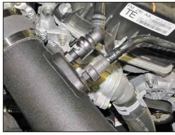
15. Connect the crank case vent and EVAP vent lines to the fittings installed into the K&N® intake tube