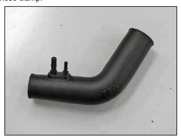
13. Install Quick disconnect fittings into the K&N® intake tube as shown.

NOTE: Plastic NPT fittings are easy to cross thread. Install the vent fitting "hand" tight, then turn it two complete turns with a wrench.