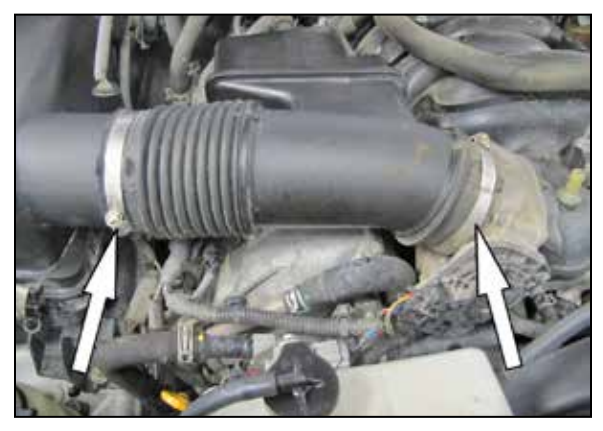
4. Loosen the two hose clamps securing the factory intake tube

3. Disconnect the crank case vent hose and fuel pressure regulator vent hose from the factory intake tube.