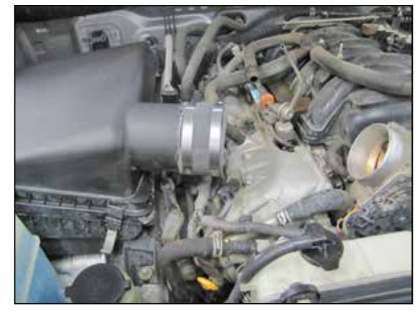
8. Install the provided coupling hose (08760) onto the air filter housing and secure with the provided hose clamp