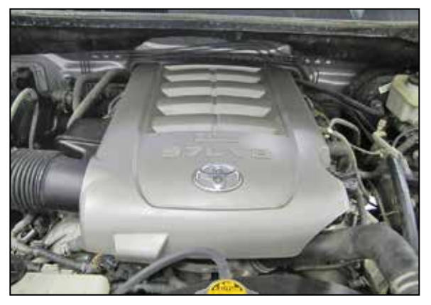
2. Lift up the decorative engine cover and remove it from the engine.

3. Disconnect the crank case vent hose and fuel pressure regulator vent hose from the factory intake tube.