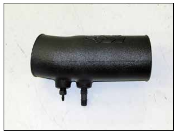
10. Install the two provided vent fittings into the K&N intake tube as shown.