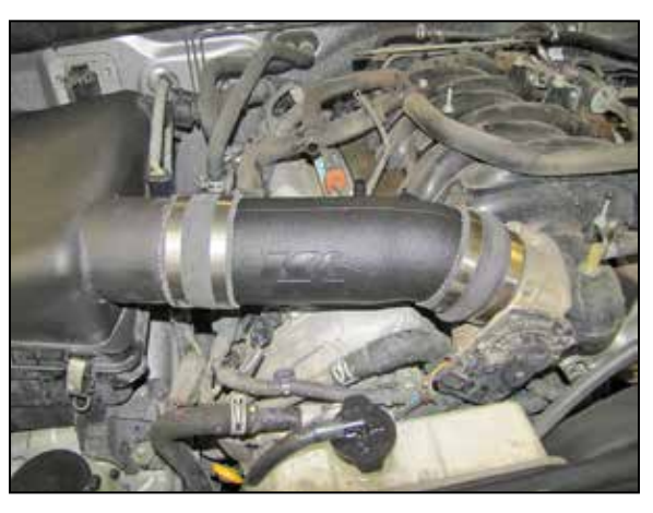
11. Lift up the upper air filter housing, install the K&N® intake tube into the silicone hoses and then reinstall and latch the upper air filter housing. Adjust the tube for best fit and then secure with the provided hose clamps.