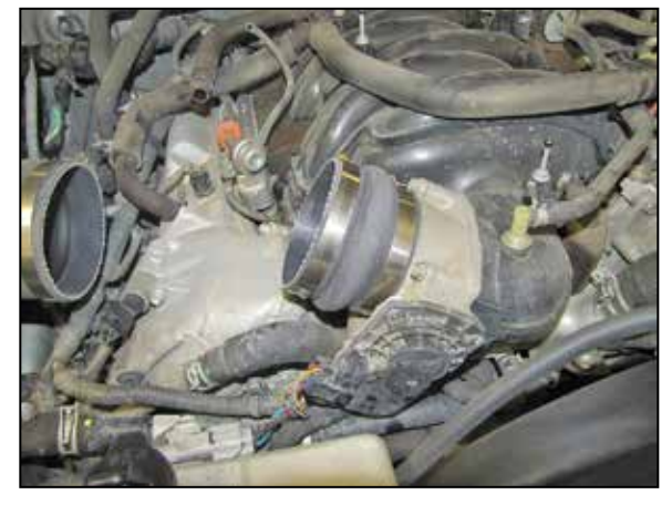
9. Install the provided hump coupling hose (08699) onto the throttle body and secure with the provided hose clamp.