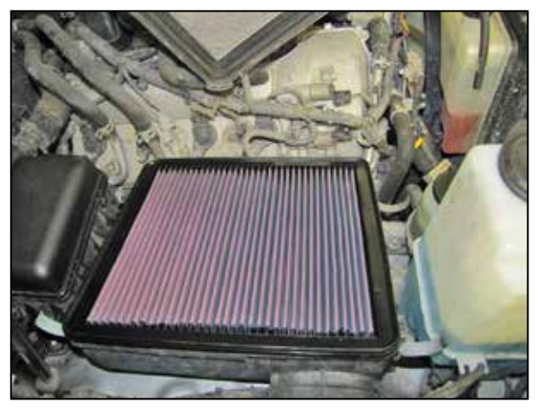
7. Install the K&N® air filter into the lower air filter housing and replace the upper housing but do not latch the retaining clips at this time.