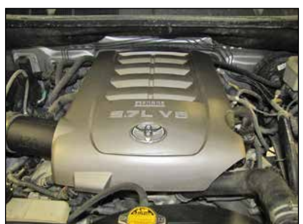
Reinstall the decorative engine cover.

13. Install the union fitting into the K&N® crank case breather hose and then connect the hose to the factory crank case vent hose and the fitting installed into the K&N® intake tube.