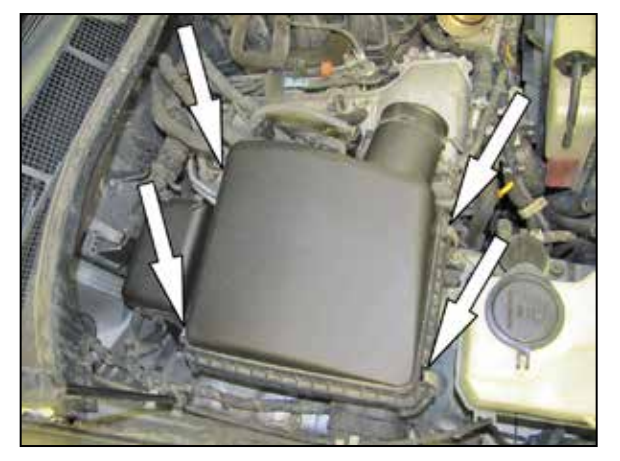
6. Release the four clips retaining the upper air filter housing and then lift off the housing and remove the factory air filter.