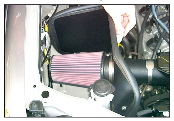
34. Install the K&N<sup>®</sup> air filter onto the K&N<sup>®</sup> intake tube as shown.

NOTE: Drycharger<sup>®</sup> air filter wrap; part # RF-1045DK is available to purchase separately. To learn more about Drycharger<sup>®</sup> filter wraps or look up color availability please visit http://www.knfilters.com<sup>®</sup>.