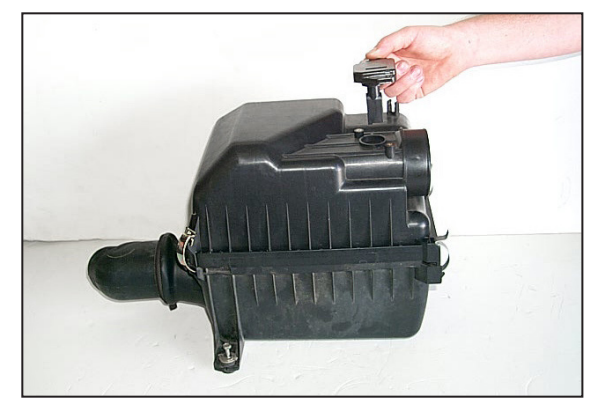
10. Remove the two screws that secure the mass air sensor then remove the mass air sensor as shown.