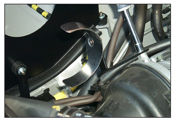
27. Install the saddle bracket assembly onto the threaded boss on the cam cover with the provided hardware as shown above.

26. Install the silicone hose and hose clamps onto the throttle body as shown above.