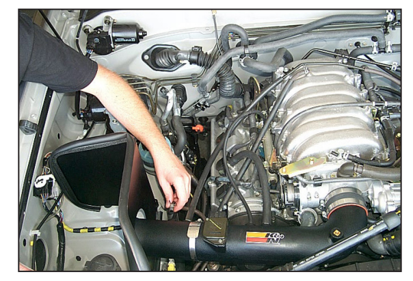
31. Install the three provided vent hoses onto the K&N ^{\circ} intake tube. Also re-connect the one existing vent as shown.