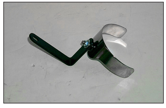
25. Assemble the saddle bracket assembly with the provided hardware as shown above.

NOTE: Plastic NPT fittings are easy to cross thread. Install the vent fitting "hand" tight, then turn it two complete turns with a wrench.