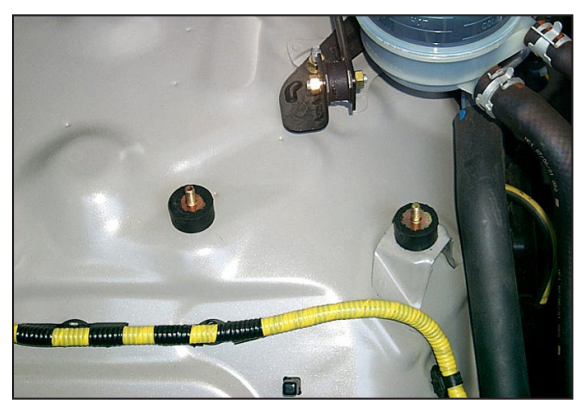
16. Install the two bumper studs into the original airbox mounting locations as shown.