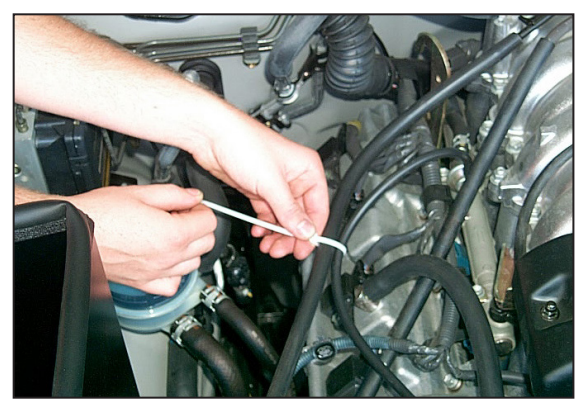
36. Zip tie the EVAP cannister vent hose and the fuel pressure regulator vent hose together as shown.