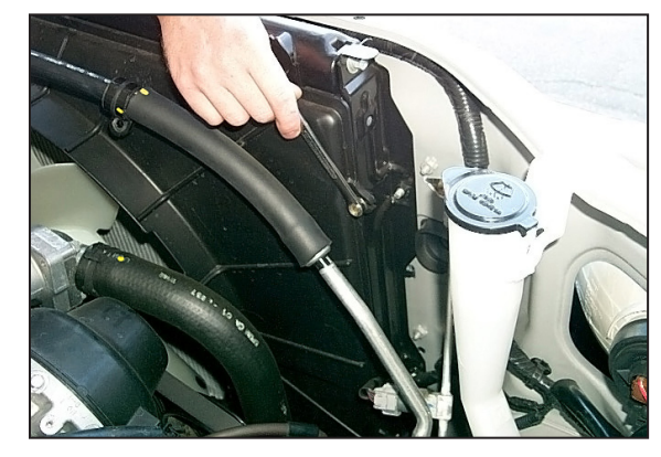
17. Remove the hex bolt from the radiator fan shroud as shown above.