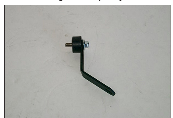
13. Assemble the angle bracket and the bumper stud with the provided hardware as shown above. Do not tighten completely.