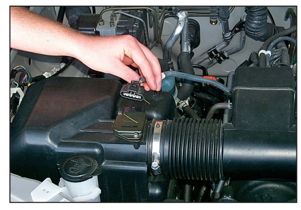
3. Disconnect the mass air sensor electrical connection.

2. Loosen the two nuts that secure the throttle body cover then remove the throttle body cover