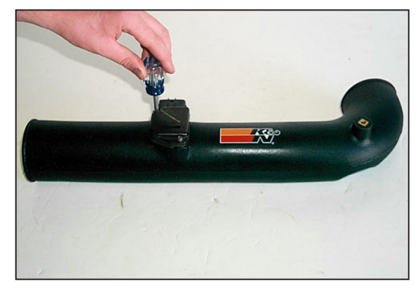
23. Secure the mass air sensor to the K\&N^{\otimes} intake tube using the provided spacers and screws.