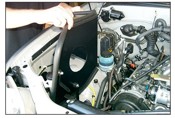
18. Install the heat shield assembly into the vehicle as shown.