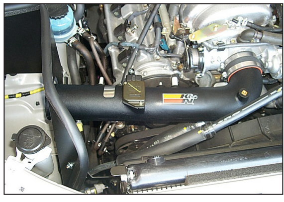
28. Install the K&N<sup>®</sup> intake tube onto the throttle body and align the tube with the saddle bracket.