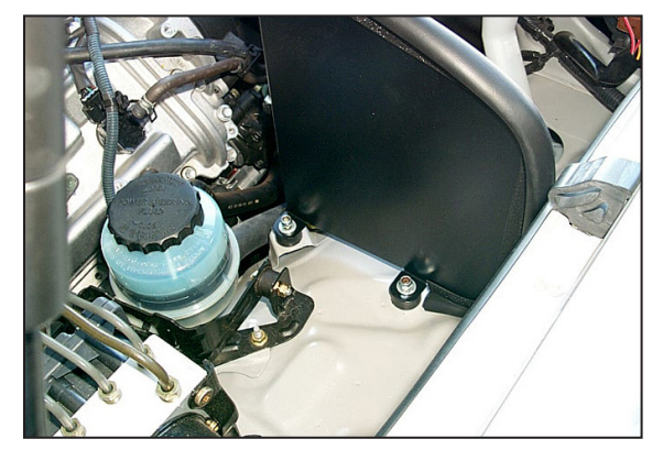
19. Secure the rear mounting tabs to the bumper studs with the provided hardware as shown.