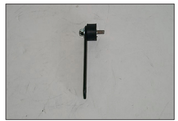
12. Assemble the straight bracket and the bumper stud with the provided hardware as shown above. NOTE: Do not tighten completely.