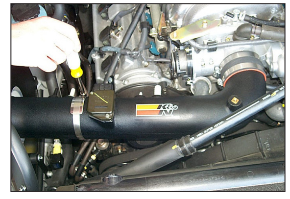
29. Secure the K&N<sup>®</sup> intake tube to the saddle bracket with the provided hose clamp. Also, tighten the hose clamp at the throttle body.