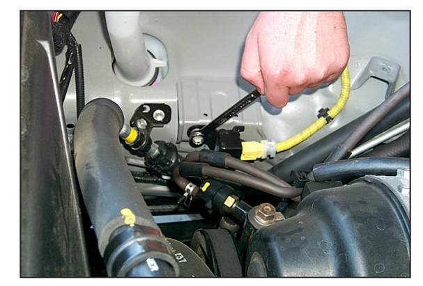
11. Remove the hex bolt from the inner fender as shown above.