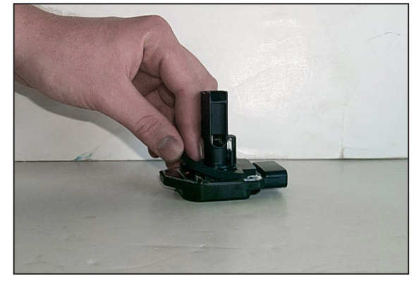
22. Apply the gasket to the mass air sensor, sticky side down as shown above.