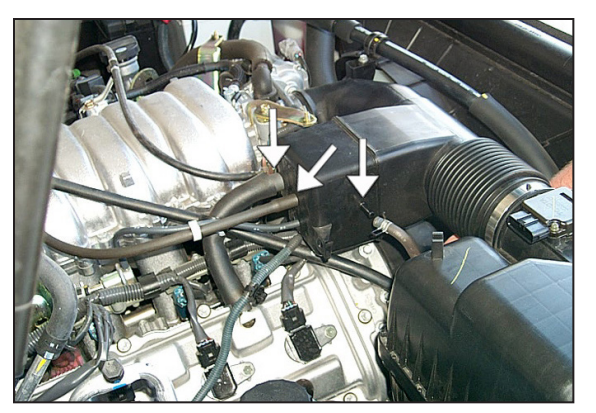
4. Remove the vent lines from the air intake resonator as shown.