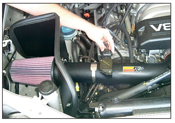
35. Re-connect the mass air sensor electrical connection.

NOTE: Drycharger<sup>®</sup> air filter wrap; part # RF-1045DK is available to purchase separately. To learn more about Drycharger<sup>®</sup> filter wraps or look up color availability please visit http://www.knfilters.com<sup>®</sup>.