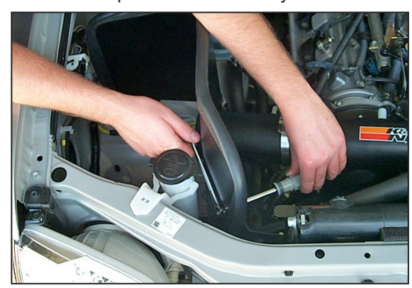
30. Tighten all the brackets and hose clamps and adjust as necessary.