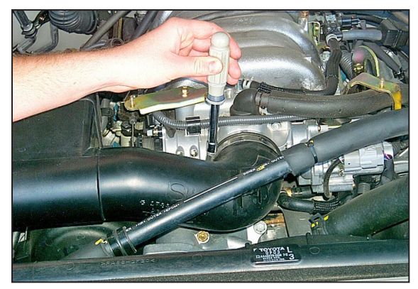
6. Loosen the hose clamp at the throttle body as shown.

5. Loosen and remove the hex bolt that secures the a/c hardline to the factory intake tube.