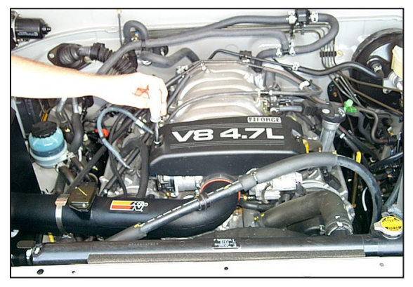
33. Re-install the throttle body cover as shown.

32. Using the hex bolt removed in step 5, secure the a/c hard line to the threaded boss on the K&N<sup>®</sup> intake tube.