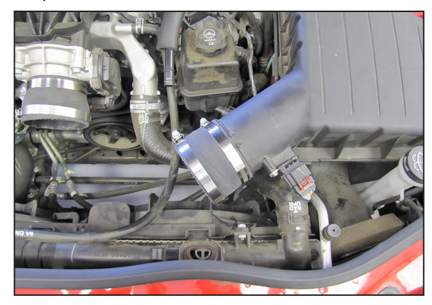
9. Install the remaining coupling hose onto the air box outlet and secure with the provided hose clamps.