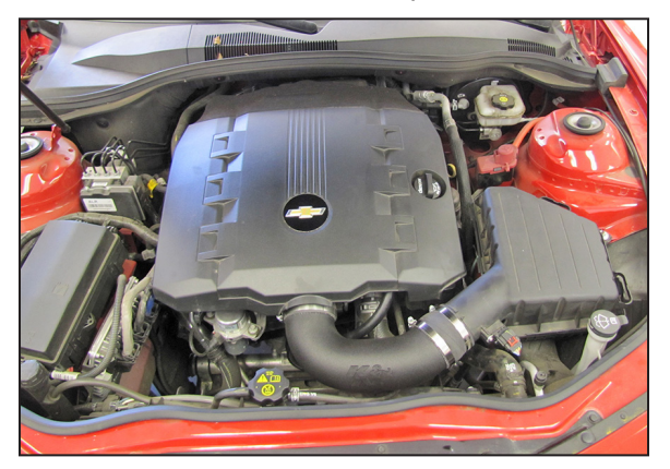
14. Reconnect the vehicle's negative battery cable. Double check to make sure everything is tight and properly positioned before starting the vehicle.

16. It will be necessary for all K&N<sup>®</sup> high flow intake systems to be checked periodically for realignment, clearance and tightening of all connections. Failure to follow the above instructions or proper maintenance may void warranty.