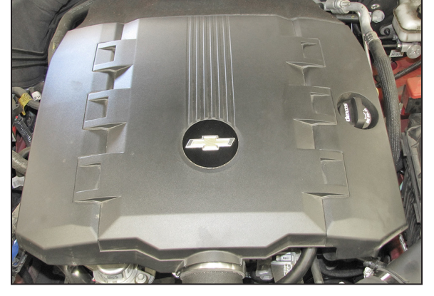
13. Remove the oil fill cap; reinstall the engine cover and the reinstall the oil cap.

NOTE: Some trimming of the crank case hose will be necessary.