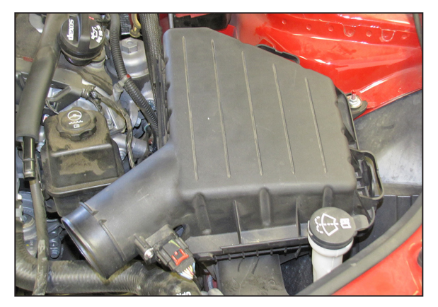
7. Reinstall the upper air box cover and latch into place.