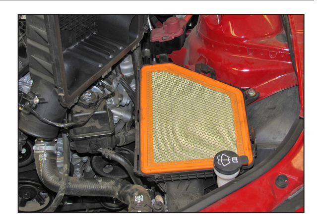
5. Releases the upper air box cover latches' and lift off the upper air box, then remove the factory air