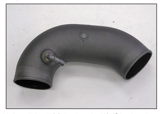
10. Install the 90° fitting into the K&N ^{\mbox{\tiny \$}} intake tube as shown.

NOTE: Plastic NPT fittings are easy to cross thread. Install the vent fitting "hand" tight, then turn it two complete turns with a wrench.