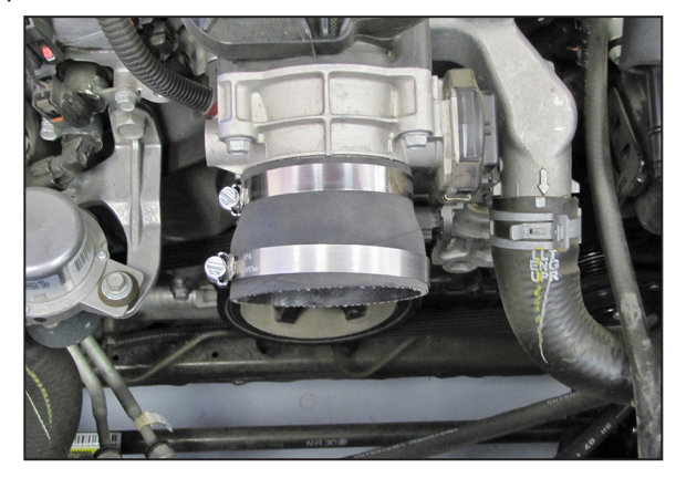
8. Install one of the provided coupling hoses onto the throttle body and secure with the provided hose clamps.