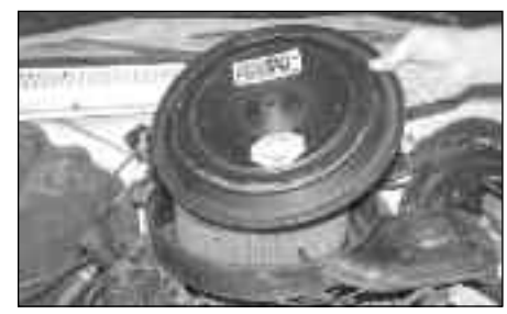
2. Loosen and remove the wing nut on the air cleaner lid, then remove the air cleaner lid.