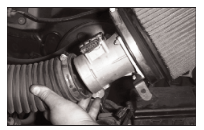
19. Attach the intake tube to the mass air sensor and tighten the hose clamp. NOTE: For best clearance it may be necessary to bend the original airbox mounting bracket away from the air filter.

20. Reinstall the coolant reservoir back to it's original position and tighten the coolant reservoir retaining nut removed in step 16.