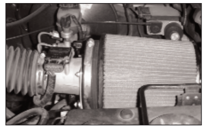
24. Reconnect the mass air sensor and air temperature sensor electrical connection.

23. Reconnect the mass air sensor and air temperature sensor electrical connection.