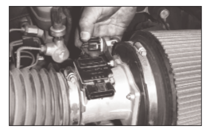
22. Install the air temperature sensor into the air temp sensor bracket and twist a 1/4 turn.

21. Twist the air temperature sensor a 1/4 turn and remove it from the airbox top. NOTE: Remove the air temperature sensor o-ring as it will not be reused.