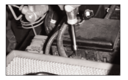
5. Loosen and remove the three bolts that secure the airbox base.

4. Release the two over center clips and remove the airbox top assembly.