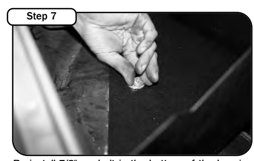
Re install 7/8"mm bolt in the bottom of the housing. Insert bolt thru the fenderwell and secure with sup-