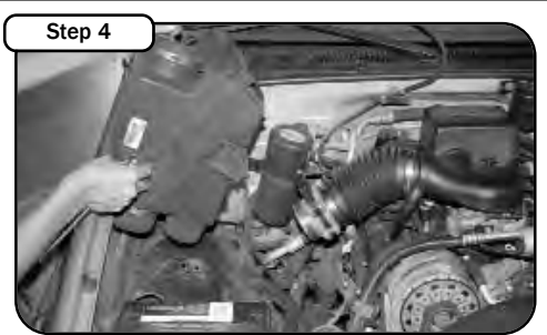
Lift up and remove the airbox assembly.