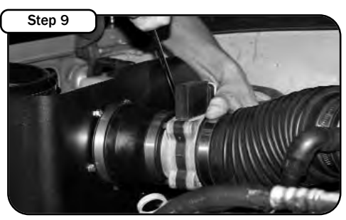
Place the supplied coupler and clamps on the air filter. Secure the MAF sensor and tighten all the