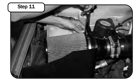
Install the pre-oiled air filter in the housing and secure with the supplied clamp. Do not use any grease or oil.