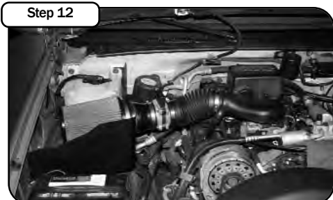
Place enclosed CARB EO sticker on a clean/smooth surface on or near the intake system. EO identification label is required in passing the Smog Check inspection. Your installation is now complete .Make sure you tighten all clamps and check all electrical connections. Re check periodically.