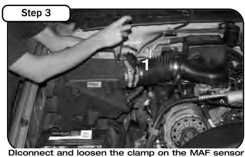
(1). Remove the three 10mm bolts securing the air box. Disconnect the Temp sensor located on the side of the air box.