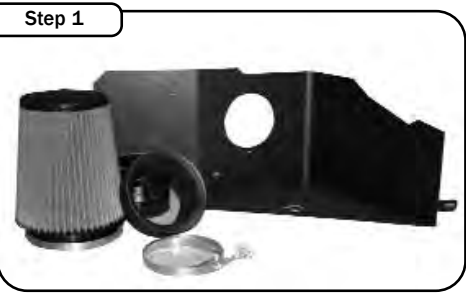
Complete stage 1 intake. Make sure all components listed are present prior to installation.