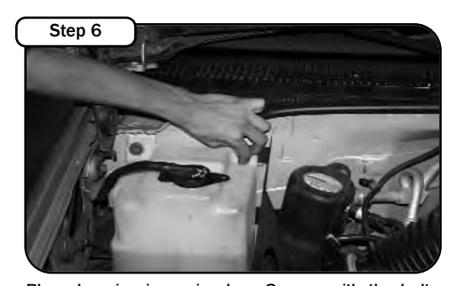
Place housing in engine bay. Secure with the bolts removed in step 5. Rear housing tab slips in behind