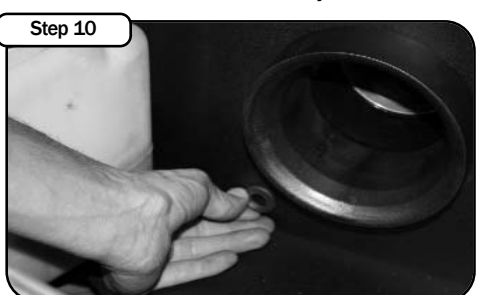
Slide the supplied grommet in the side of the housing. Install the Temp sensor.

Place the supplied coupler and clamps on the air filter. Secure the MAF sensor and tighten all the clamps.