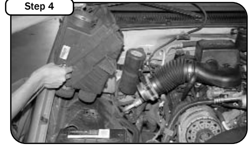
Lift up and remove the airbox assembly.

Diconnect and loosen the clamp on the MAF sensor (1). Remove the three 10mm bolts securing the air box. Disconnect the Temp sensor located on the side of the air box.