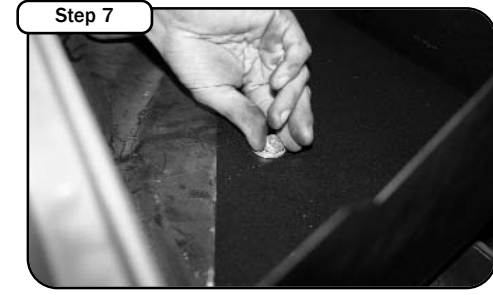
Re install 7/8"mm bolt in the bottom of the housing. Insert bolt thru the fenderwell and secure with supplied lock nut and washer.

Place housing in engine bay. Secure with the bolts removed in step 5. Rear housing tab slips in behind plastic.