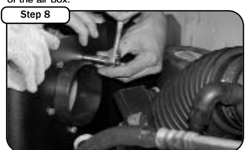
Place the air filter adapter in the housing. secure with the supplied M6 bolts and washers.