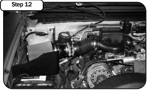
Your installation is now complete .Make sure you tighten all clamps and check all electrical connections. Re check periodically