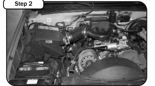
Complete stock intake.

Complete stage 1 intake. Make sure all components listed are present prior to installation.