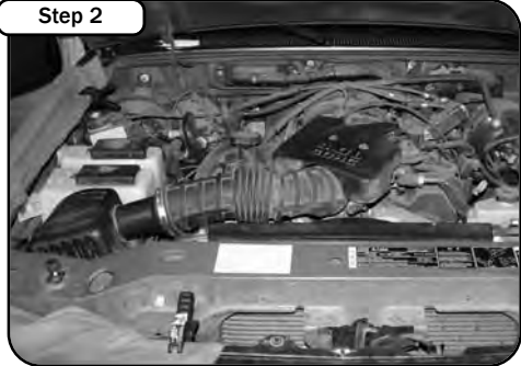
Step 2 Complete stock intake.