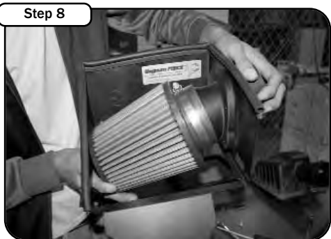
Step 8 Insert the new air filter into the intake tube. Install the filter from the bottom of the housing for ease of installation.