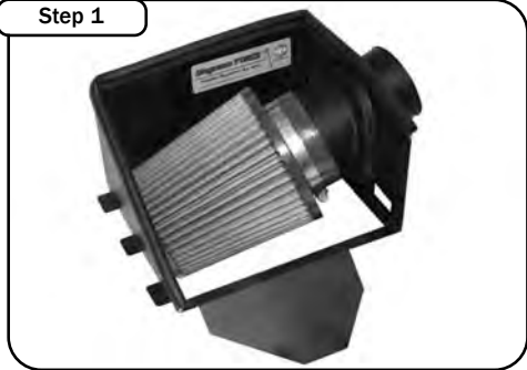
Step 1 Complete kit with parts. Please confirm parts list and read all instructions steps before proceeding with actual installation.