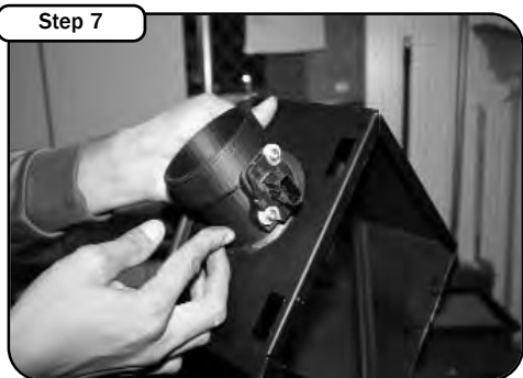
Step 7 Transfer the MAF sensor to the intake tube. Use the supplied gasket, nylon spacers, and screws. Pay close attention to the flow of the MAF sensor when inserting the sensor into the tube.