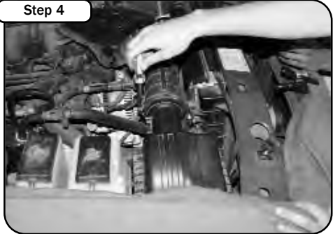
Step 4 Loosen the factory hose clamp on the intake duct.