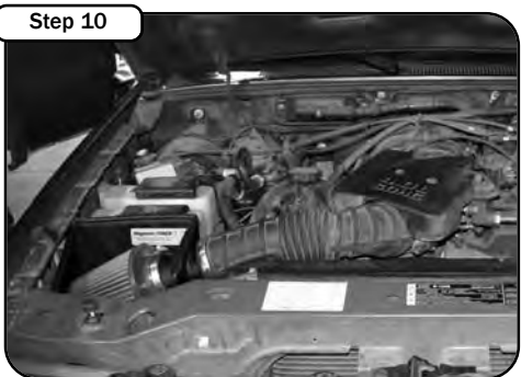
Step 10 Place enclosed CARB EO sticker on a clean/smooth surface on or near the intake system. EO identification label is required in passing the Smog Check inspection. Your installation is now complete. Make sure all hoses and clamps are tight and that all electrical components are secure. Check and retighten connections and filter after a few hours of operation. Close hood slowly to verify hood clearance.