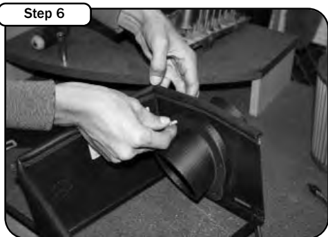
Step 6 Place the intake tube into the housing and secure with the provided nuts, bolts, and washers. Place the trim seal along the edge of the housing.