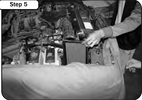
Step 5 Remove the upper portion of the air box and remove the factory air filter.