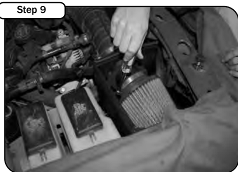
Step 9 Tighten the clamp on the air filter and re-connect the MAF sensor.