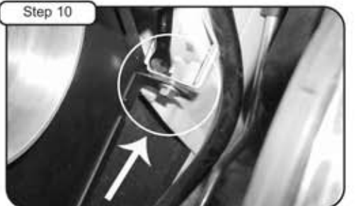
Secure back of housing tab using provided screw, wavy/flat washers and nut. Tighten using 10mm socket or wrench.