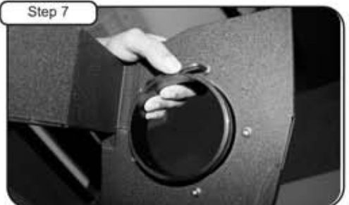
Attach filter adaptor to inside of housing and secure using button head screws provided and tighten using 6mm allen key.