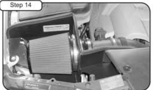
Your Stage 1 installation is now complete. Make sure you tighten all clamps and check all electrical connections periodically.