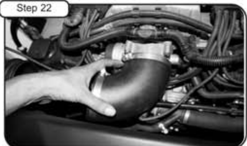
Install elbow coupler to throttle body with clamps provided.