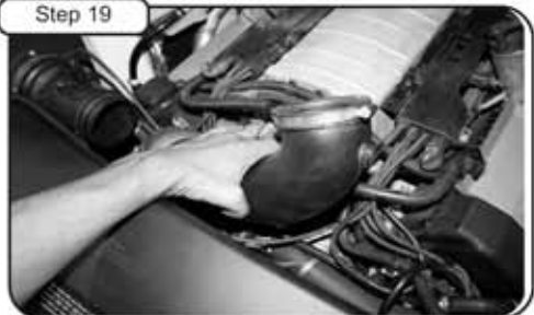
Remove stock tube from vehicle.