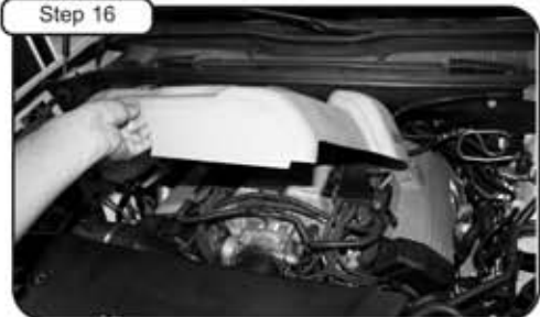
Loosen the four bolts holding engine cover using 6mm allen key and remove.

Note: Filter Cleaning and Re-oiling: When cleaning your aFe filter, be sure to use only aFe's "Restore Kit" (aFe P/N: 90-50001 blue oil aerosol, aFe P/N: 90-50501 blue squeeze bottle oil, aFe P/N: 90-59999 Pro Dry 5™ cleaner only.) Pro Dry 5™ cleaning: see cleaning instruction sheet 06-00074. For replacement part(s) or "Restore Kit" please call aFe sales/tech support @ 951-493-7100