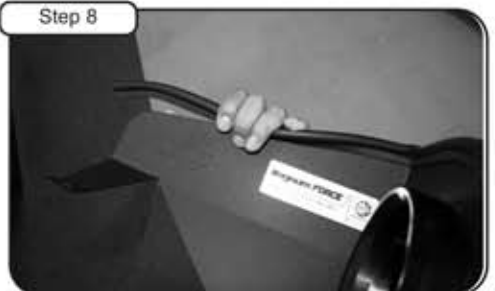
Install trim seal to housing.