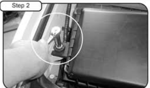
Remove the bolt holding in air box using 10mm socket or wrench. Save for later install (See step 9).