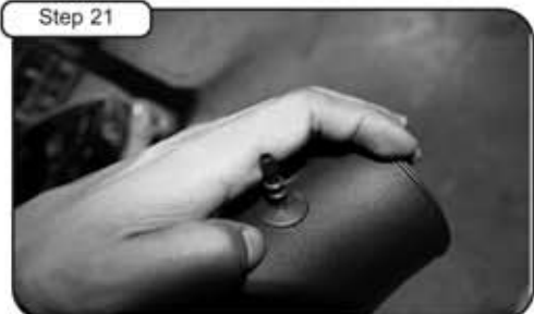
Install grommet to tube. Attach plastic fitting to grommet on tube.