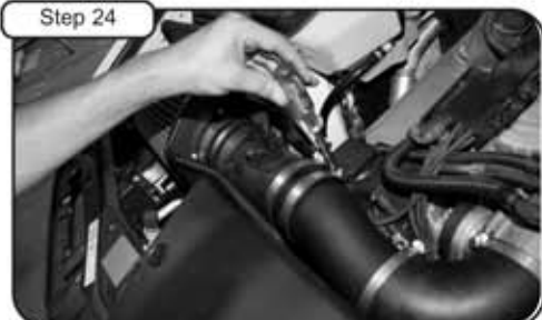
Tighten all clamps using 5/16" nut driver.