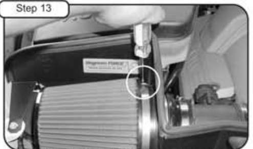
Install air filter to adaptor and tighten using 5/16" nut driver.