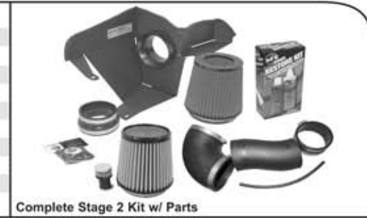
Complete Stage 2 Kit w/ Parts