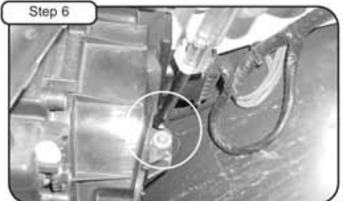
Remove bolt from back of headlight using 5/16" nut driver. Save for later install (See step 9).