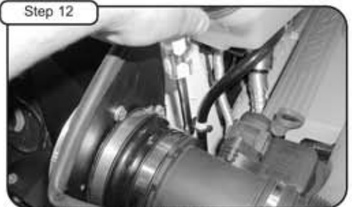
Tighten clamps using 5/16" nut driver.