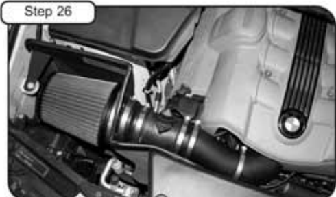
Your Stage 2 installation is now complete. Make sure you tighten all clamps and check all electrical connections periodically. Thank you for choosing aFe!