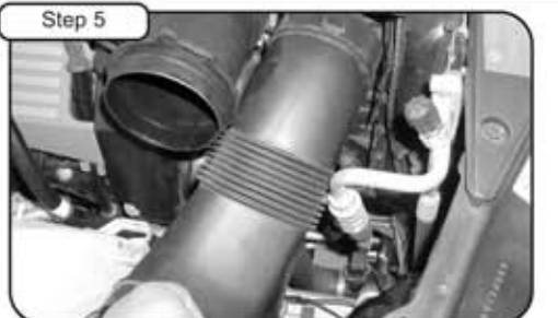
Remove stock air duct out of vehicle.