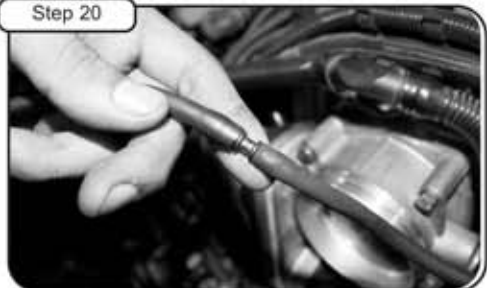
With plastic fitting and hose provided connect the vacuum line disconnected from step 18.