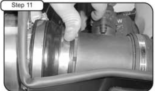
Install reducer coupler with clamps provided to adaptor and MAF sensor.