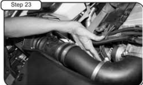
With straight coupler and clamps attach to tube. Install to MAF sensor and elbow coupler and position.