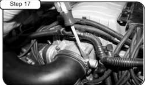
Loosen clamps on stock tube.