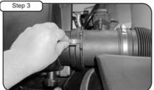
Unclip the two silver retaining clips holding in MAF sensor.