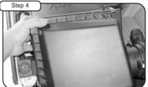
Lift and pull out air box away from MAF sensor and remove.