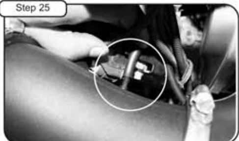
Attach vacuum line to fitting on tube.