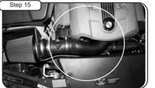
For Stage 2 install, turn page over and continue to page 2. →