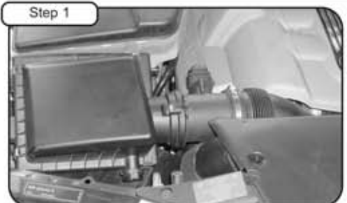
Complete Stock Intake. Disconnect battery before install.